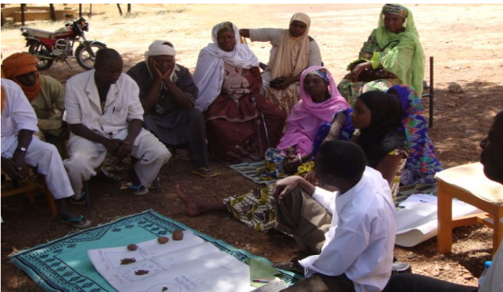
Community consultation process with fishermen in Tabalak