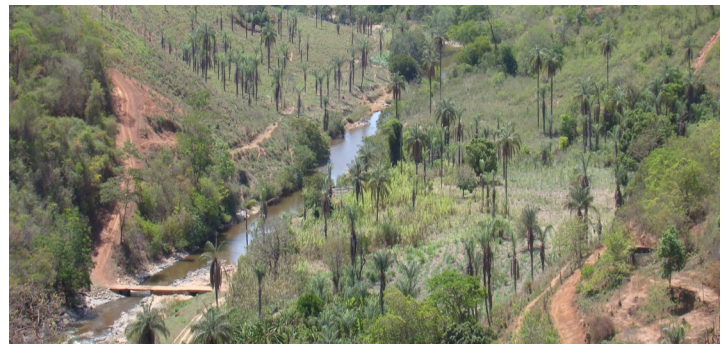
Crops around the river