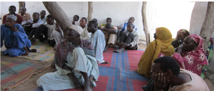
Community consultation in the Bogo landscape

Challenges to the landscape are food insecurity related to low precipitation, poor water quality leading to instances of water borne and parasitic illnesses in the population, and deforestation linked to population expansion and fuel wood harvest. Administrative governance related to land management and providing basic social services is weak. Reforestation to recover degraded land is one way the area is fighting the threat of desertification.