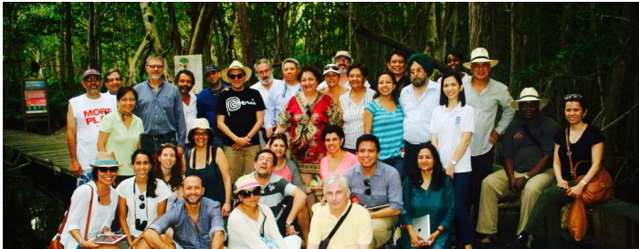
Field visit to the Celestun Biosphere Reserve