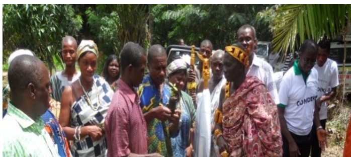
The Paramount Chief of South Dayi