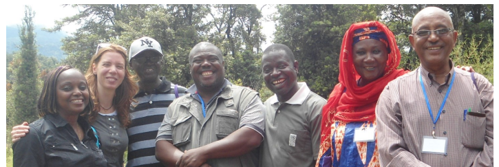
COMDEKS National Coordinators from the Africa Region Photo: Mt. Kenya

The COMDEKS Project Manager, and six COMDEKS National Coordinators from the Africa region (Cameroon, Ghana, Ethiopia, Malawi, Namibia, and Niger) met in Mt. Kenya in September 2013 on the side of the COMPACT replication workshop, focused on key lessons and results emerging from twelve years of SGP's work in the context of the COMPACT programme (Community Management of Protected Areas for Conservation).