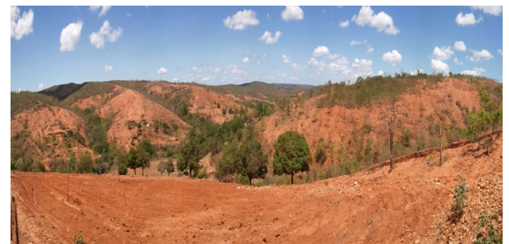
Exposed soil in the landscape

In consultation with local partners and communities, the target landscape for COMDEKS activities in Brazil has been identified in a 40,000 hectares area in the Jequitinhonha Valley, one of the poorest regions of Brazil. Decades of unsustainable environmental practices have led to overexploitation of the soil and degradation of the landscape. Additionally, in the late seventies the eucalyptus monocultures invaded the landscape contributing to water scarcity. The area, in the transition between the Cerrado and the Caatinga biomes, encompasses several traditional communities and small farmers.