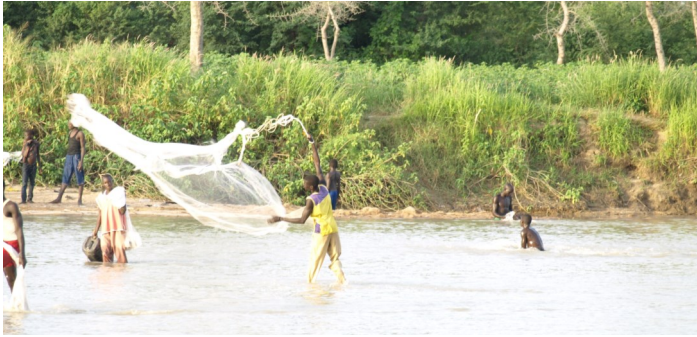
Fishermen casting their nets in Bogo