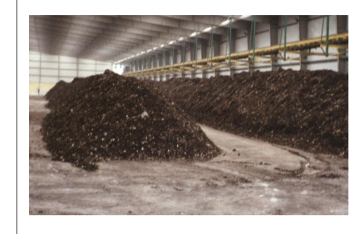
STEP 5. Compost for Farming