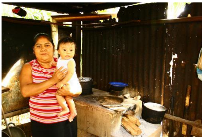
Families enjoy indoor cook stoves with ventilation, eliminating smoke

The energy efficient stoves improved living conditions in participating households. For one, 15 environmental activists were trained in the construction and maintenance of the stoves. This skill has provided them with the opportunity to earn additional income. Moreover, the eco-stoves require 50% less firewood than the old models, which resulted in considerable financial savings as families were able to downsize their purchases. For those women who could not afford to buy firewood, the time required to search and collect firewood was cut down in half. Health conditions improved as well. The new eco-stove is enclosed and has a chimney. It thus eliminates indoor toxic fumes, which primarily affect women and children, from the houses and reduces the risk of burn injuries for children. Overall, these energy efficient stoves are appreciated as an improvement in the houses, if not seen as more beautiful than the traditional open cook stove models.