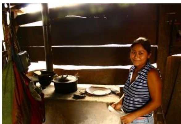
CETA modified cook stove

The technology enables communities to lower firewood consumption and therefore reduce deforestation. In Nicaragua, excessive use of firewood is a serious issue for the environment. SGP Nicaragua has thus placed great emphasis on helping to improve environmental conditions in the dry areas such as Apante Hill by supporting energy efficient cook stove projects and by establishing energy forests for sustainable firewood supply. The government has also acted on the serious deforestation issue and launched a National Strategy for Firewood and Charcoal (2011-2012). SGP Nicaragua is one of the government's partners to support the implementation of the strategy.