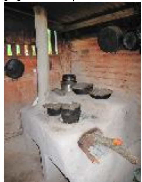
CETA Modified Eco-Stove

SGP Nicaragua's intervention point was to support the dissemination of the efficient stove, and help the women refine the stove model to suit their own local, traditional kitchens. The "know-how" of the stove technology was initially transferred through "train-the-trainer" concept. Initially, 4 environmental promoters were trained by a local NGO who then trained another 11 women in the construction of the stove through a workshop. Much learning rested on "learning by doing" (tacit learning). The women trainees, who were selected by their communities, then built and replicated the stoves for other households in their communities. Relatives and other beneficiaries joined in at the stove building.