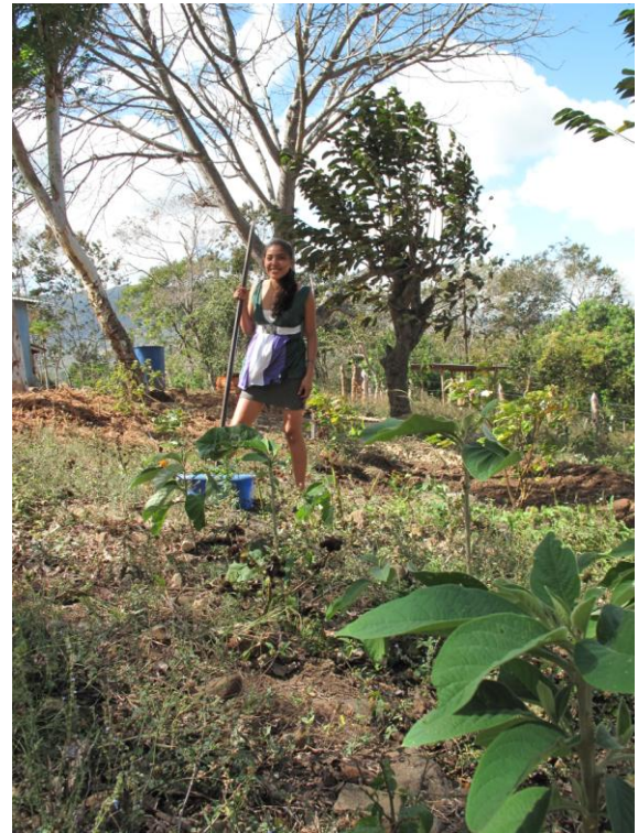
Reforestation of the degraded watershed area

The proposed efficient stove technology was accepted by the beneficiaries because they were also introduced to various practices for sustainable natural resource management through workshops held by the Ministry of Natural Resources. More than 300 community members became more aware of the importance of sustainable forest management, learning about environmental protection; techniques for reforestation and crop diversification to relieve pressure on forest degradation; and pollution prevention of the principal watershed of the protected area. The increased awareness motivated participants to rehabilitate the forest. Giving priority to reforestation in the river areas, the project participants managed to plant more than 6,000 tree seedlings covering 4.3 hectares of degraded forestland in the main watershed area. One part was reserved as an energy forest.