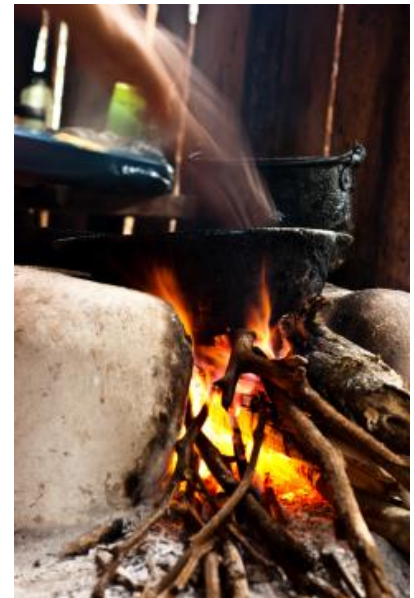
Traditional, open-fire cook stoves

The use of firewood as primary energy source for cooking, on the other hand, has been exerting additional pressure on forest resources. Although the forest belongs mainly to small farmers, many families do not have access to firewood due to the strong degradation of the forest resources. Consequently, poor families then often resort to healthy forests in the protected area or enter the private property of big farmers to extract firewood. In sum, deforestation and unsustainable agricultural practices have impacted the health of the local watershed and its water supply, which had already been strained by a strong reduction in the raining season.