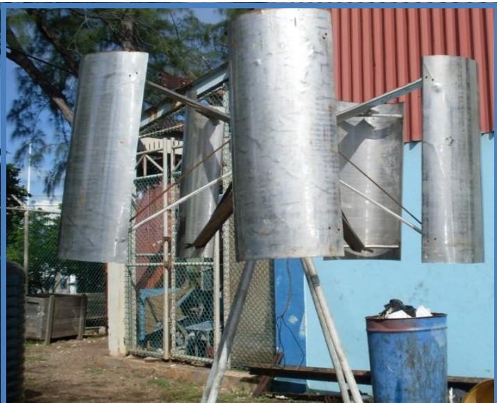
Wind turbine produced from recycled oil barrels

The objective of the JMITF was not only to pilot this technology but to establish a national renewable energy centre with a focus on continuous research, development, training and certification of the CMI under the ISO 9001:2008 quality status, thus contributing to national growth and development. Other activities included educational tours, the development of an operational manual and marketing of the technology on special events such as the Maritime Week.