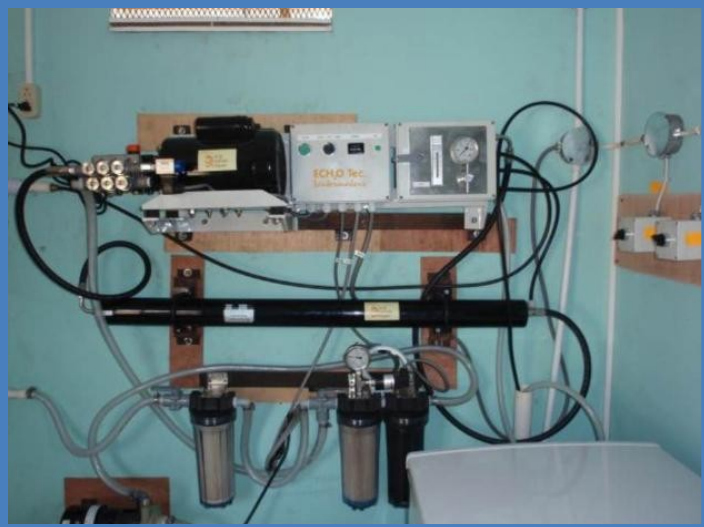
Wind-powered Reverse Osmosis (RO) machine to purify water