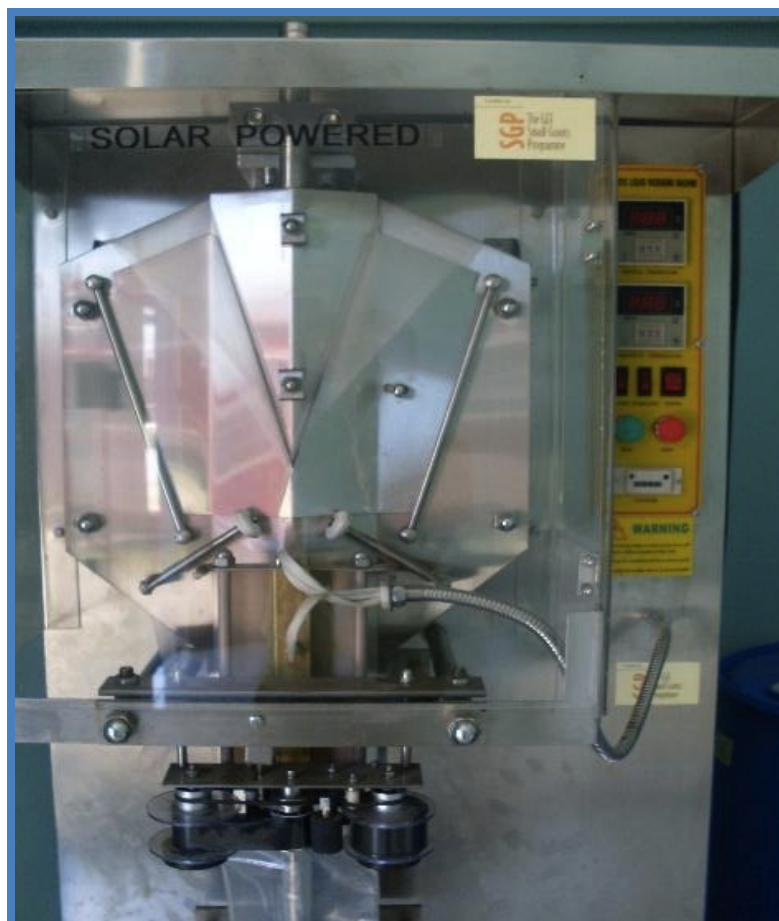
Solar-powered water bagging machine

To address these challenges, the JMIF decided to take the lead in finding affordable solutions through applied energy research and education -while utilizing appropriate technology- with the objective of creating renewable energy solutions for disenfranchised and marginalized communities. The CMI aims to produce qualified graduates that are ready to provide solutions to the many challenges faced by the country, given that the CMI is the only training facility of this kind in the English speaking Caribbean countries.