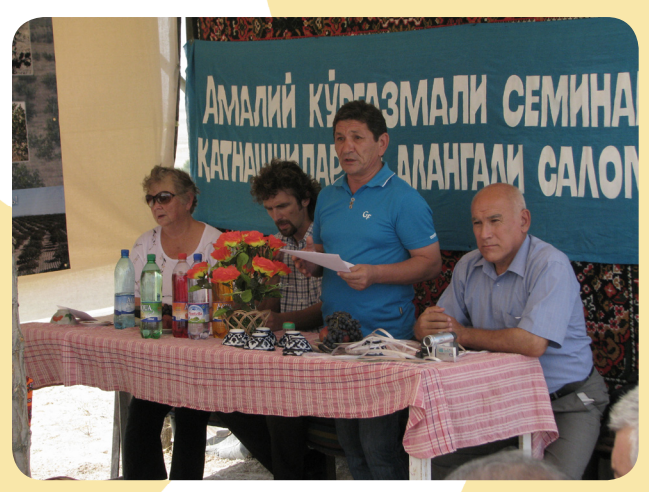
So, what are the conclusions?

GEF SGP continues to propagate the given practice all over the country in the regions where pistachio growth is possible. The project is being implemented in Kuruksay settlement of Chirokchi district, Kashkadarya region. Mixed planting of pistachio and almond is being tested there. The matter is as follows: the main resisting factor to start pistachio plantations is a long term before getting initial crop (5-7 years). Almond gives crop on the 3rd year. Planted in pistachio rowspacing, almond can generate quicker income to the farmer; by the time when pistachio starts giving crop in full volume (18-20 years), almond should be cut off so that to create optimal conditions for pistachio growth. We are going to calculate economic efficiency of this kind of mixed plantations and will share the results.