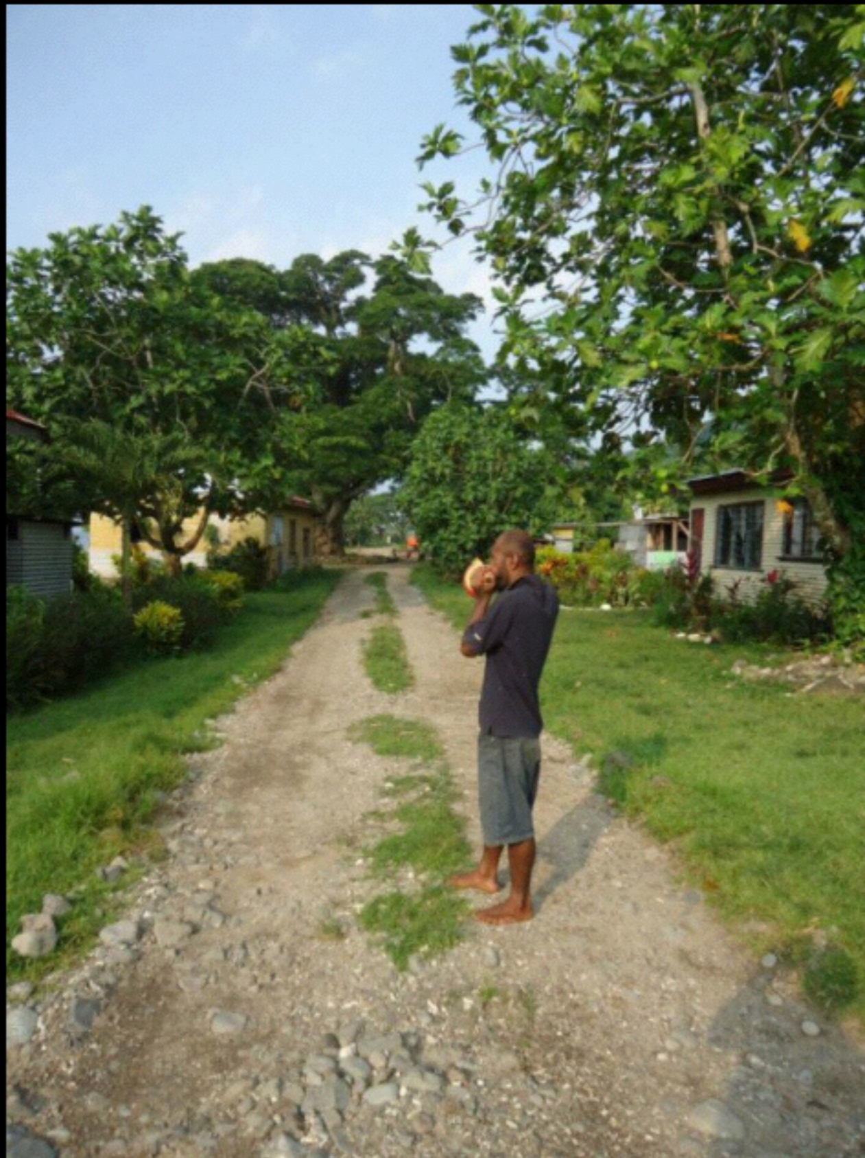
The village headman of Naqaravutu village blows a conch shell to herald the arrival of the COMDEKS team and summon villagers to a village meeting. Community consultations and a baseline assessment were conducted by COMDEKS grantee Birdlife International in early 2013.