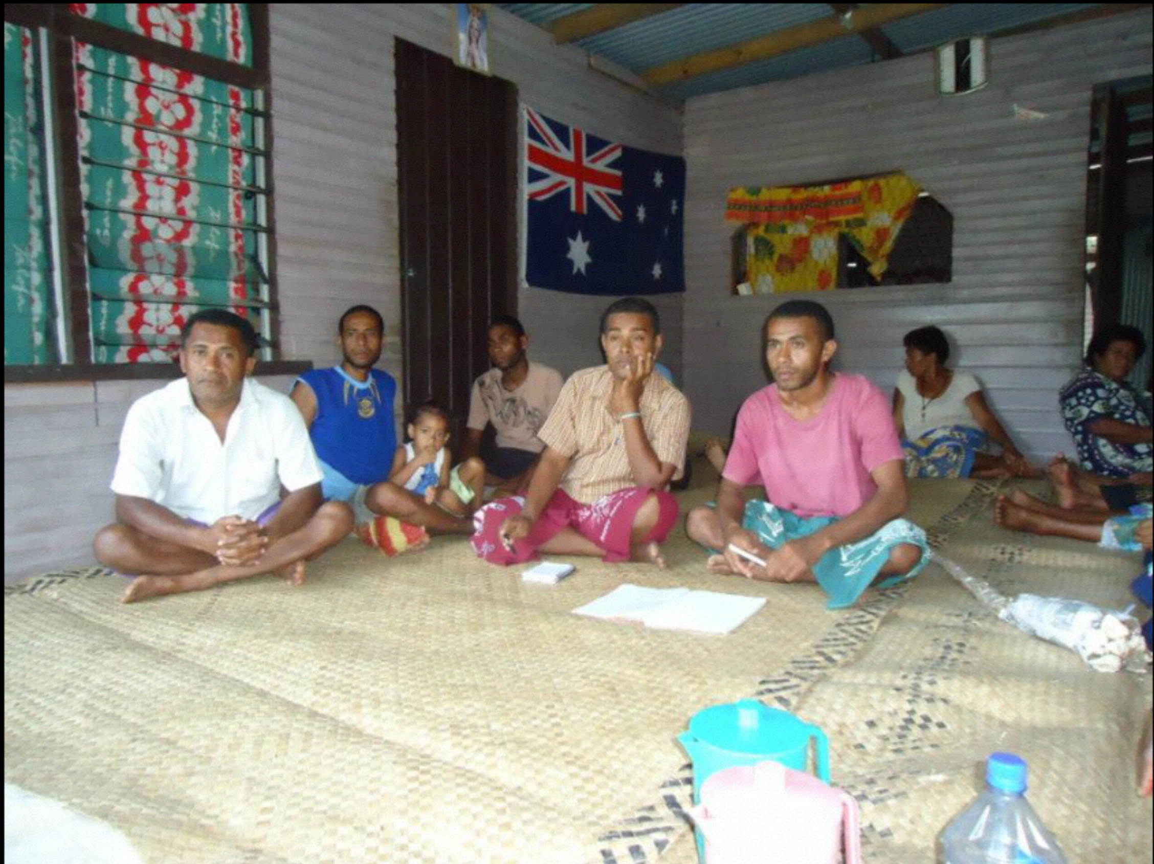
Villagers of Naqaravutu wait patiently to begin a consultative meeting to discuss landscape challenges and opportunities. Throughout the Natewa-Tunuloa peninsula the limitation on economic opportunities and poor social infrastructure have contributed to underdevelopment of the landscape. Poverty incidence for the landscape population is high; surveys conducted in 2009 indicate 62% of the total population from the two districts falling within this category.