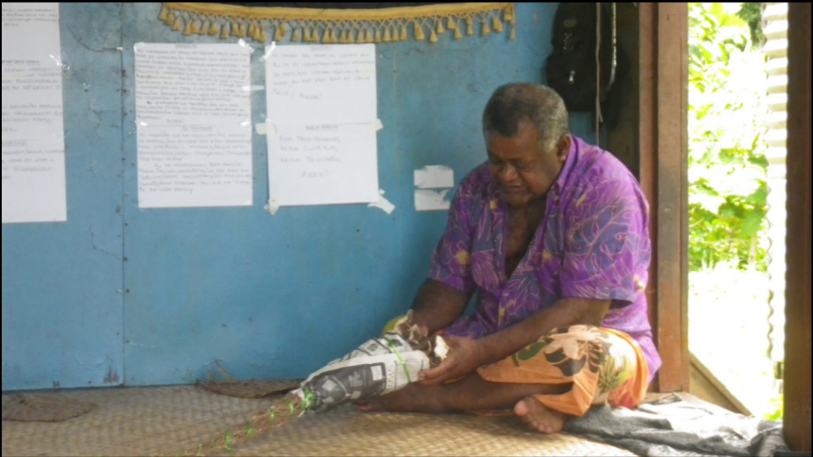
The chief of Nailou Village receives an offering of the yaqona or kava (sci: piper methysticum) roots from the COMDEKS community consultation team in a ceremony called i sevusevu, as a token of respect and request for permission to carry out their work in the village.