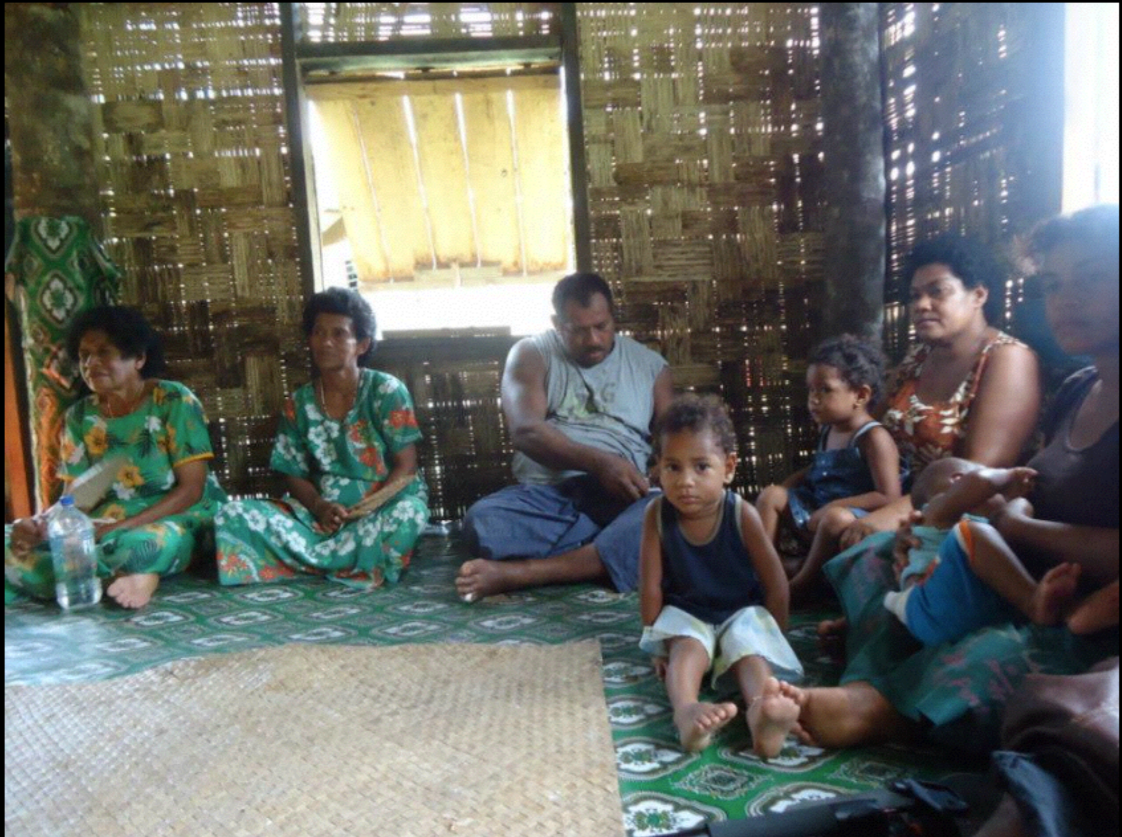
Nailou villagers listen to the presentation by Fiji's COMDEKS scoping team in their village meeting house constructed from flattened bamboos.