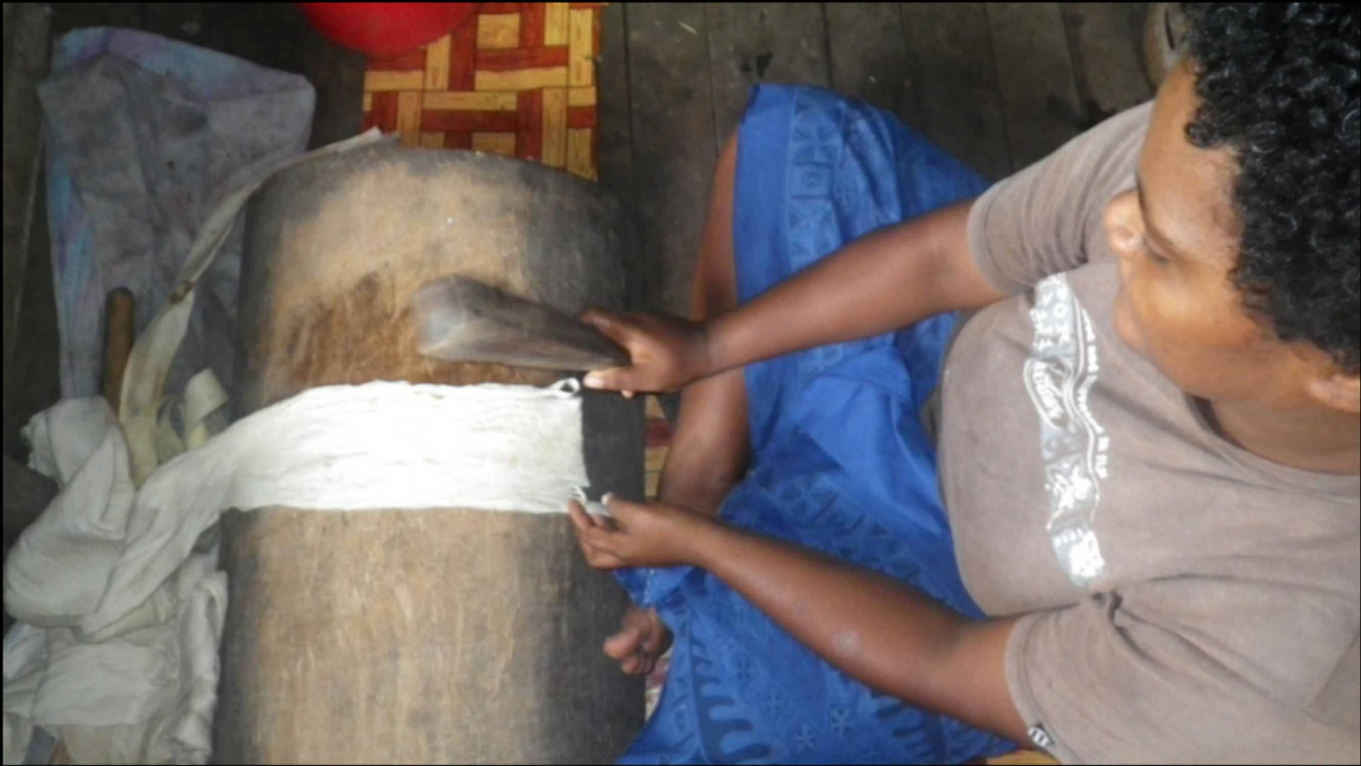
The area was once a regional center for the production of tapa or masi, a traditional cloth made from bark. COMDEKS activities in the area present an opportunity to meld local traditional knowledge and practices with modern innovations, concepts, and technology to invigorate the landscape and its communities.