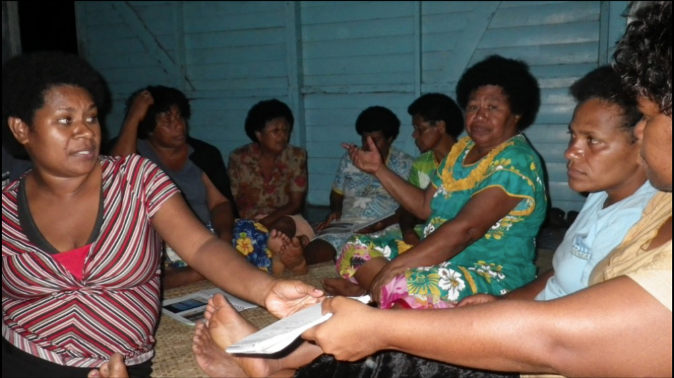
Women of the Vusaratu and Dawa villages in Natewa discuss some points during the scoping exercise. The baseline assessment process in the Natewa-Tunuloa Peninsula was an opportunity to discuss some conservative traditional gender roles which place women in a subservient role within communities. Despite this, women in the landscape have proven a great talent in conserving community assets and natural resources. Gender integration in COMDEKS funded activities aims to strengthen women's capacities and participation in community governance and decision making processes.