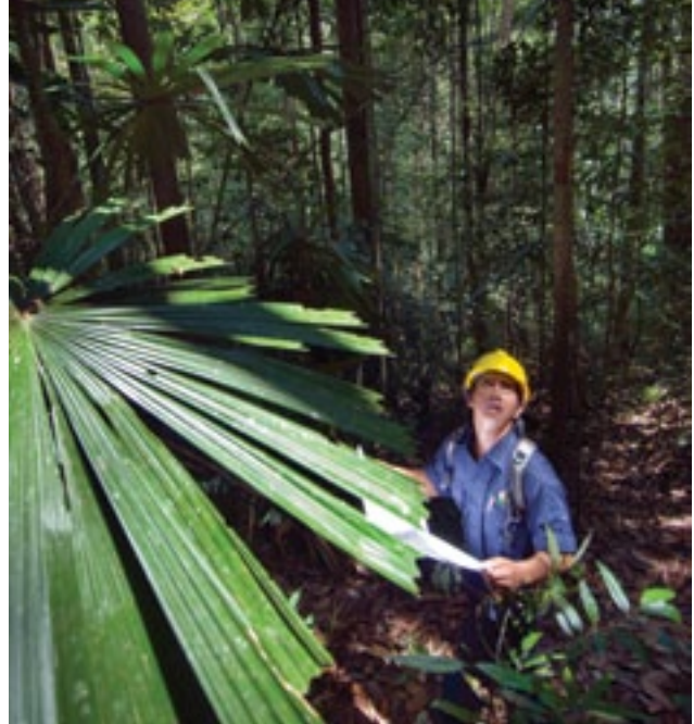
Forest planner looks for mature trees to tag for harvest at the number four concession logging area in the Kalimantan region of Borneo, Indonesia.

equate economic growth with deforestation and forest degradation. As a result, investments in REDD+ should contribute to supporting growth and development while reducing impacts on forests—for example, by improving practices in natural resource industries, making better use of degraded lands, and creating new low-carbon enterprises.