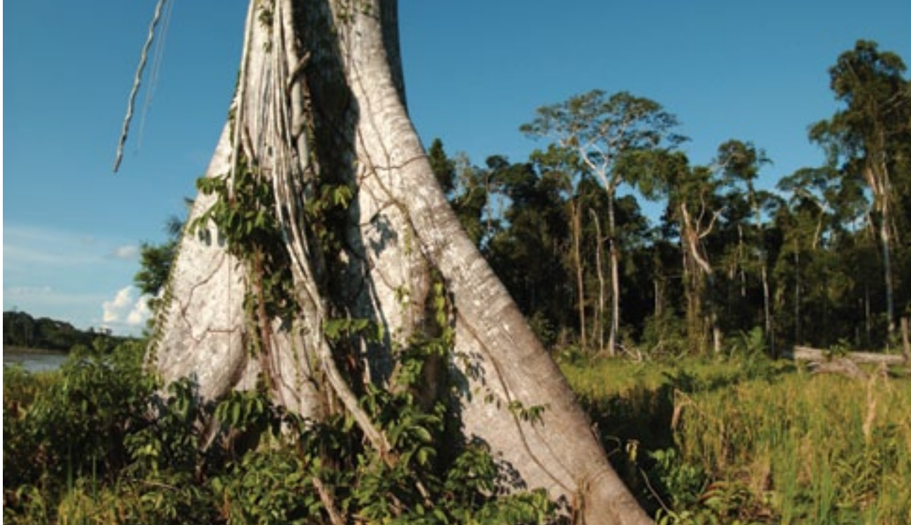
Buttress of a large rainforest tree in the Amazon watershed, Acre, Brazil.