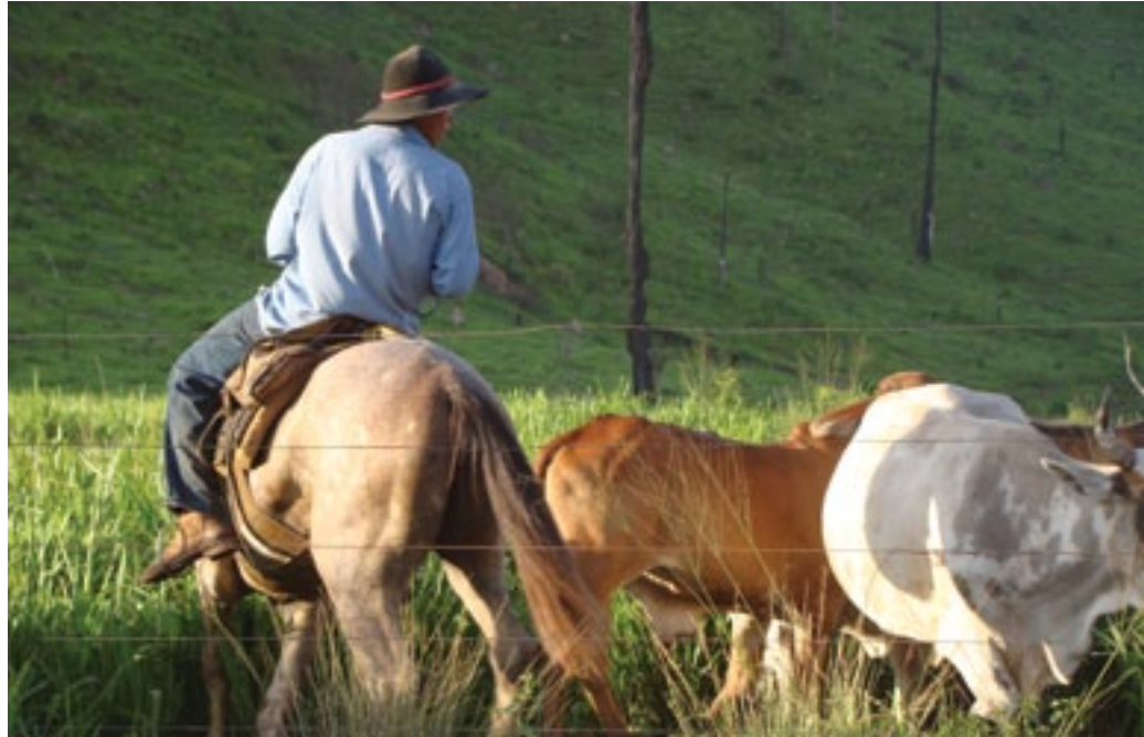
LEFT: Residents of Bethania ejido, a communally owned territory in Quintana Roo, México, use a portable sawmill to cut planks of wood from trees they harvest. The planks can then be carried out of the forest with minimal impact. RIGHT: Cattle ranching is a growing business in São Félix do Xingu, a municipality in the Brazilian Amazon, where The Nature Conservancy works with ranchers to avoid forest clearing while increasing production.