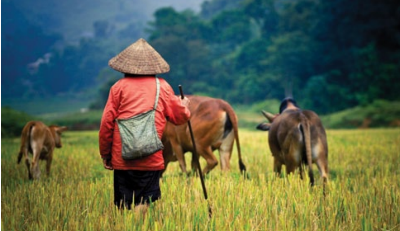
Buffalo shepherd on the rice field.

The foundation of the project was the passage of the Community Forestry Sub-Decree (2003), a law allowing communities to secure 15-year renewable management rights for community forest areas. The 13 community forests have created management plans and applied to the Forest Administration for legal recognition.