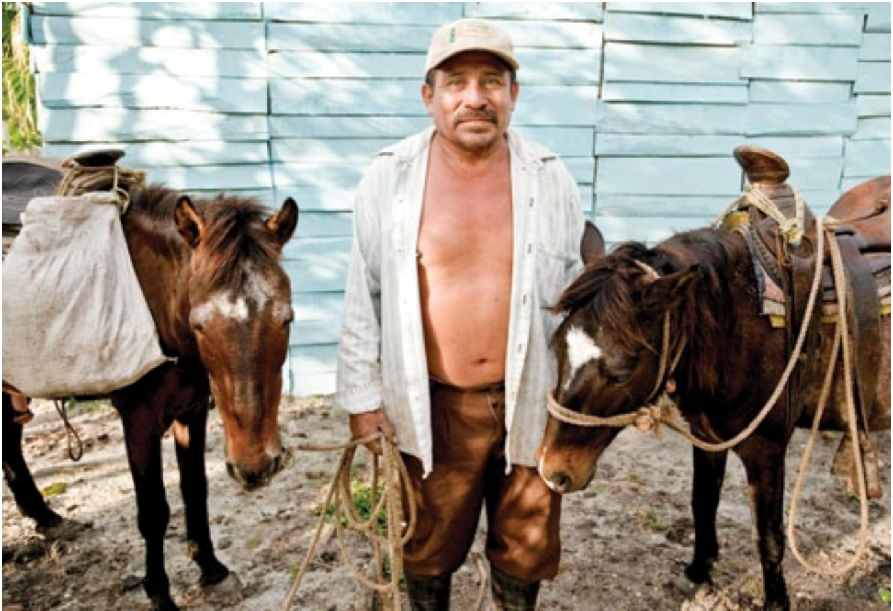
A chiclero stands with his ponies outside his home in the ejido Veinte de Noviembre, situated in the Maya Forest of Mexico's Yucatan Peninsula.