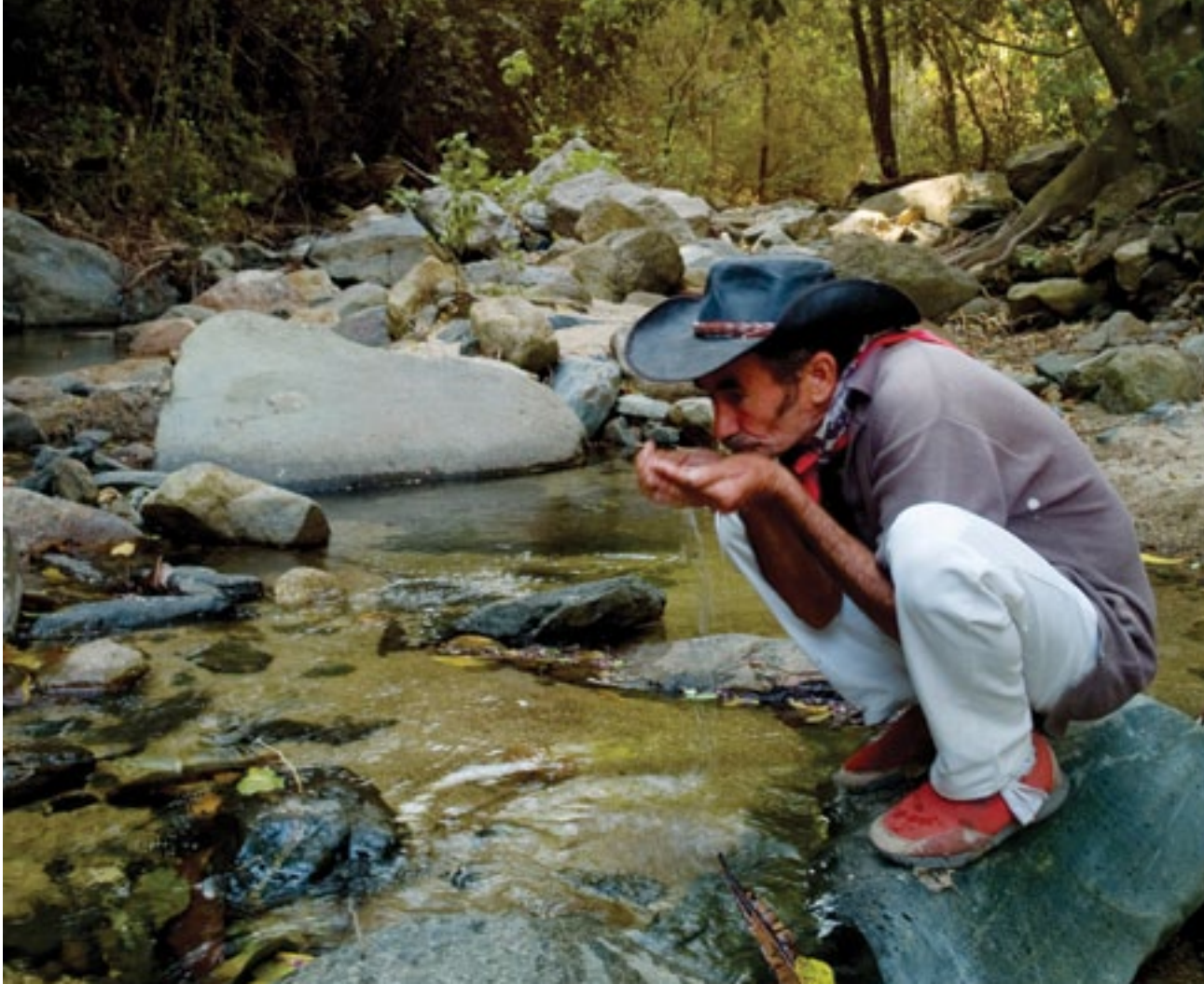
A local farmer and ecotourism guide drinks from a mountain stream that flows from Colombia's coastal mountain range, Sierra Nevada de Santa Marta, to the Caribbean sea through Tayrona National Park, which contains one of the wildest equatorial rain forests in northern South America.