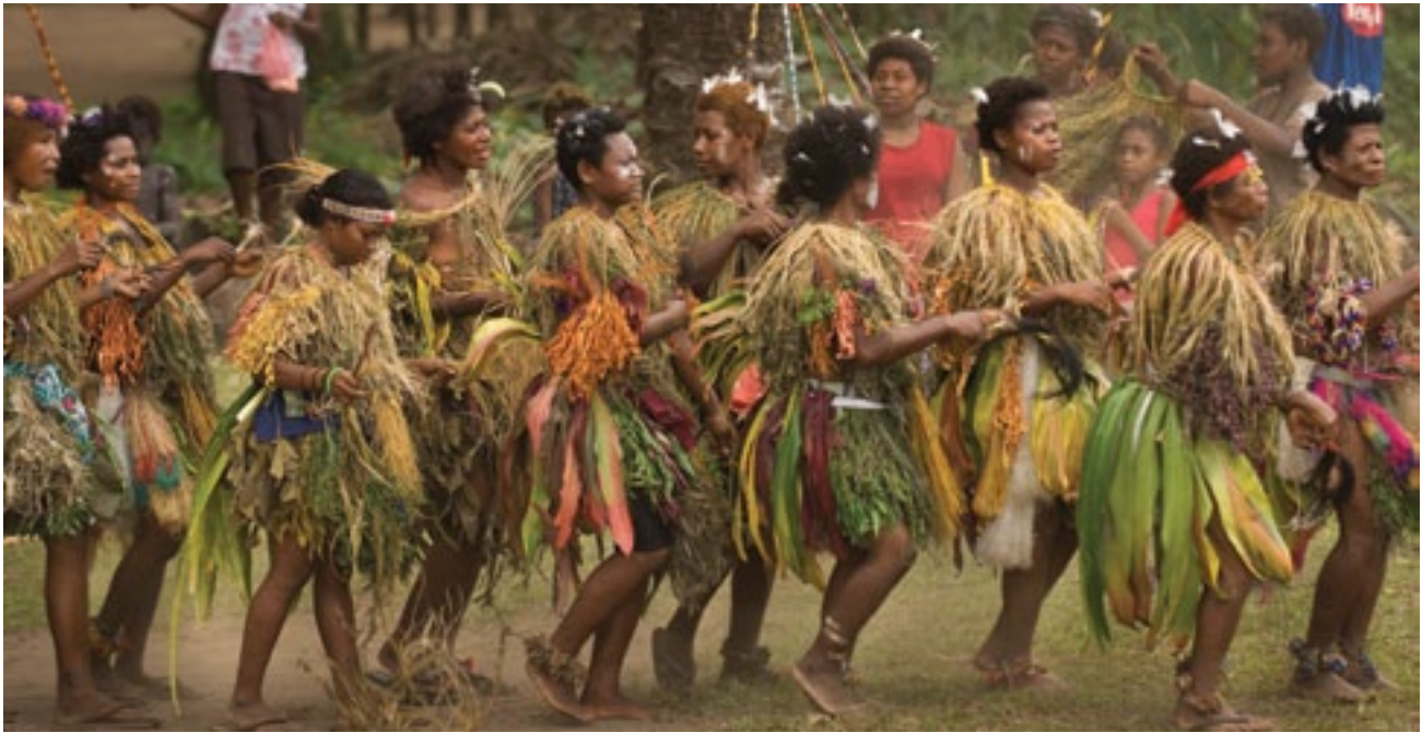
Dancers participate in traditional singing welcoming ceremony at Tarobi village on the Kimbe Bay coast in West New Britain, Papua New Guinea.

conditions (e.g., Martin 2009; Wunder et al. 2008). Related to this, projects must explicitly consider equity in their design if they are to successfully avoid reinforcing existing inequities, or possibly even becoming a poverty trap (e.g., Asquith et al. 2002; Bond et al. 2009; Leisher et al. 2010). Many decentralized approaches suffer from high inequity, and literature from PES programs and community forest management suggests that some inequities may stem from high transaction costs for smallholders, inflexible tenure arrangements and benefits that are too low relative to requirements for participation (e.g., RECOFTC 2007; Pagiola et al. 2005; Wunder et al. 2008). Further, decentralized approaches may risk carrying forward biases and constraints of the existing resource management regime, thus reinforcing rather than addressing underlying drivers and inequities (Madeira et al. 2010).