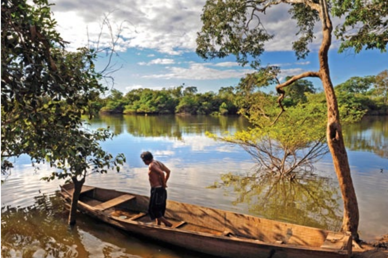
A wooden boat resting on the river bank at Cururu, Bolivia (located at the South East of Bolivia in part of the moist tropical forests of the country).