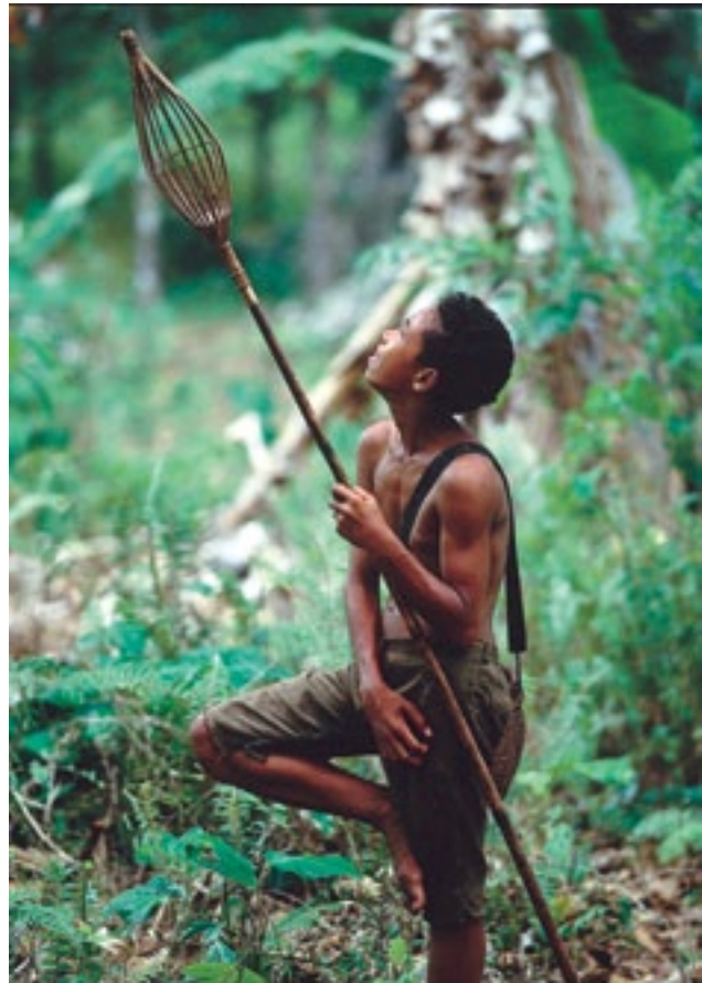
Nutmeg harvesting in Maluku, Indonesia.

A good example of the need for incentives across multiple levels is the beef sector in Brazil, outlined in Table 1. At the national level, Brazil has in place a command-and-control regulation that requires landholders in the Amazon to maintain 80% of their land in forest cover. This law has been on the books for years, but recently the federal government has begun a serious enforcement effort to ensure that landholders are complying. As part of this push, the national government published a list of the municipalities in the Amazon with the highest deforestation rates and cut off credit lines for those jurisdictions. This move effectively spurred state and municipal