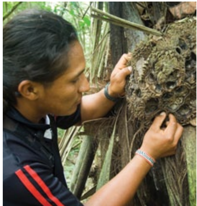
TOP: Woodcarvers, Madang, Papua New Guinea. BOTTOM: A local naturalist guide examines Ivory-nut palm ( Phytelephas aequatorialis ) source of “tagua” fruit (also called “vegetable ivory,” popular for making jewelry), in the moist high-elevation forests in Manabí Province near Ecuador’s Pacific coast.