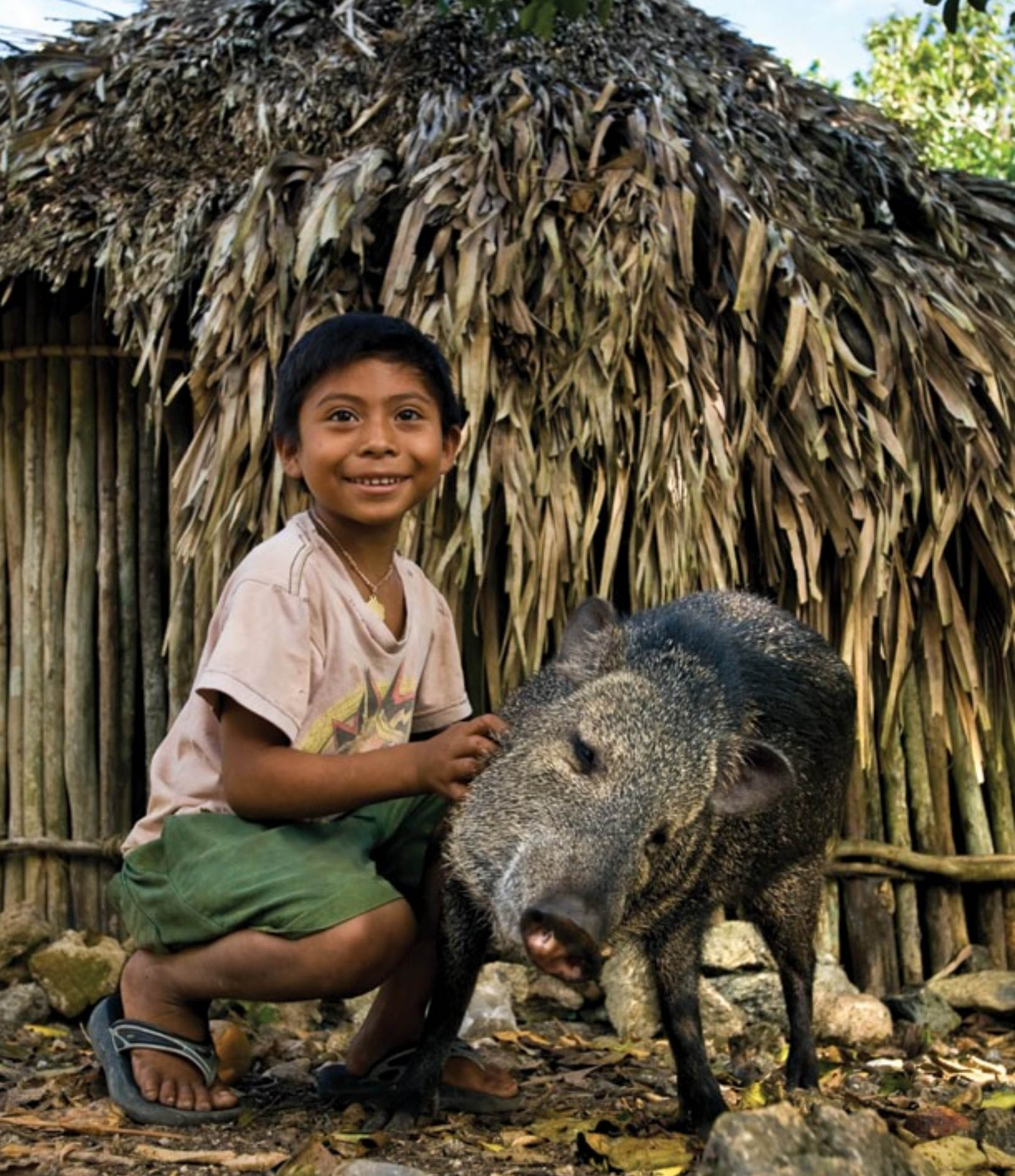
Young boy with a pig outside a hut in Veinte de Noviembre, an ejido or self-governing land cooperative, in the Maya Forest of Mexico's Yucatan Peninsula.