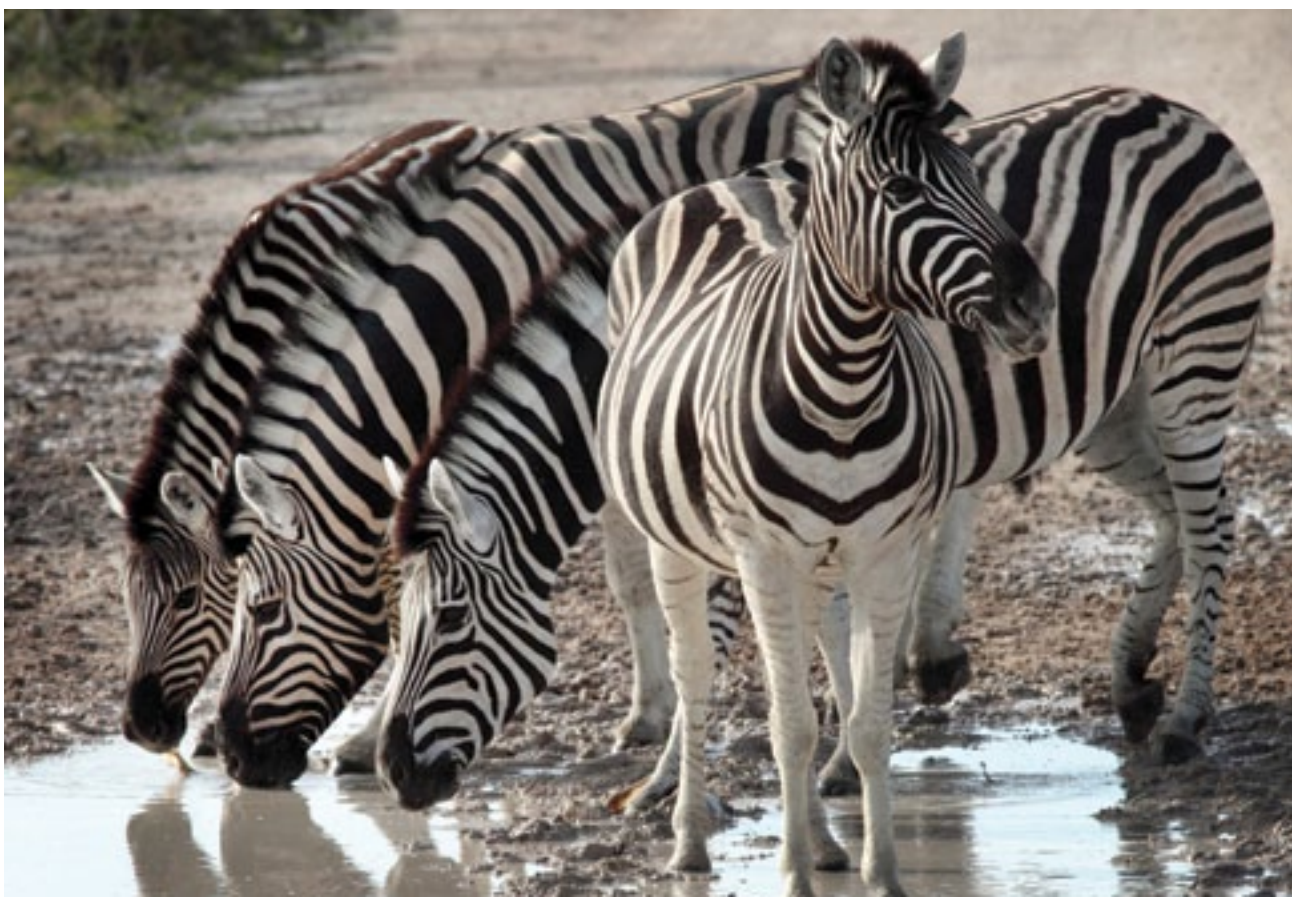
Zebras in Botswana.