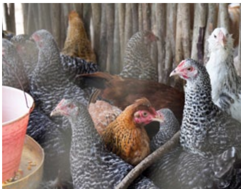
Chickens in Bethania ejido in Quintana Roo, Mexico, where many families live in traditional thatched roof homes.

Below are 10 case studies of very different mechanisms. Each case study includes an overview of the program, lessons relevant to REDD+ programs, and details of key design aspects, such as targeting, tailoring, financial structure, legitimacy, and alignment. Three cases are related to REDD+, while the majority come from the management of other natural resources.