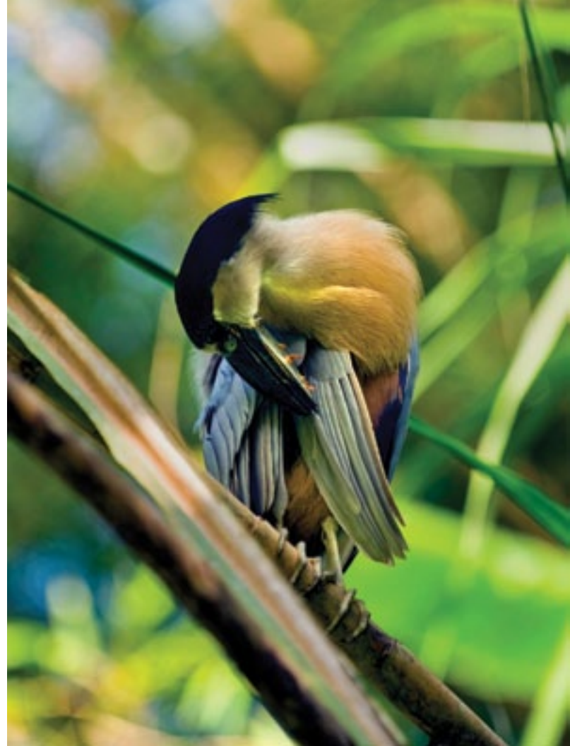
Boat-billed Heron ( Cochlearius cochlearius ) cleans its wings in the rainforest of Costa Rica, which covers only 0.01 percent of Earth's landmass, but is believed to host approximately five percent of its biological diversity.

FONAFIFO has also adapted by developing a standardized instrument to streamline and increase enrollment in forest conservation (known as Certificados de Servicios Ambientales, or CSA). Since developing this tool, the number of agreements with water users has sharply increased because FONAFIFO no longer has to