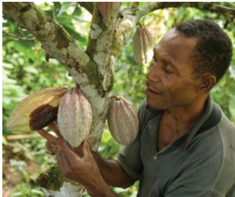
A local villager examines cacao pods hanging from a tree in the Adelbert Mountain Range of Papua New Guinea's Madang Province. The seeds from the cacao, or cocoa pod, are used to produce chocolate, an increasingly important source of revenue for small villages in the Adelbert Mountain range.

In its approach to managing diamond revenues, Botswana successfully aligned their disbursement of revenues with broader national priorities through a dedicated ministry and multi-year planning tool to manage the allocation of funds to different line ministries.