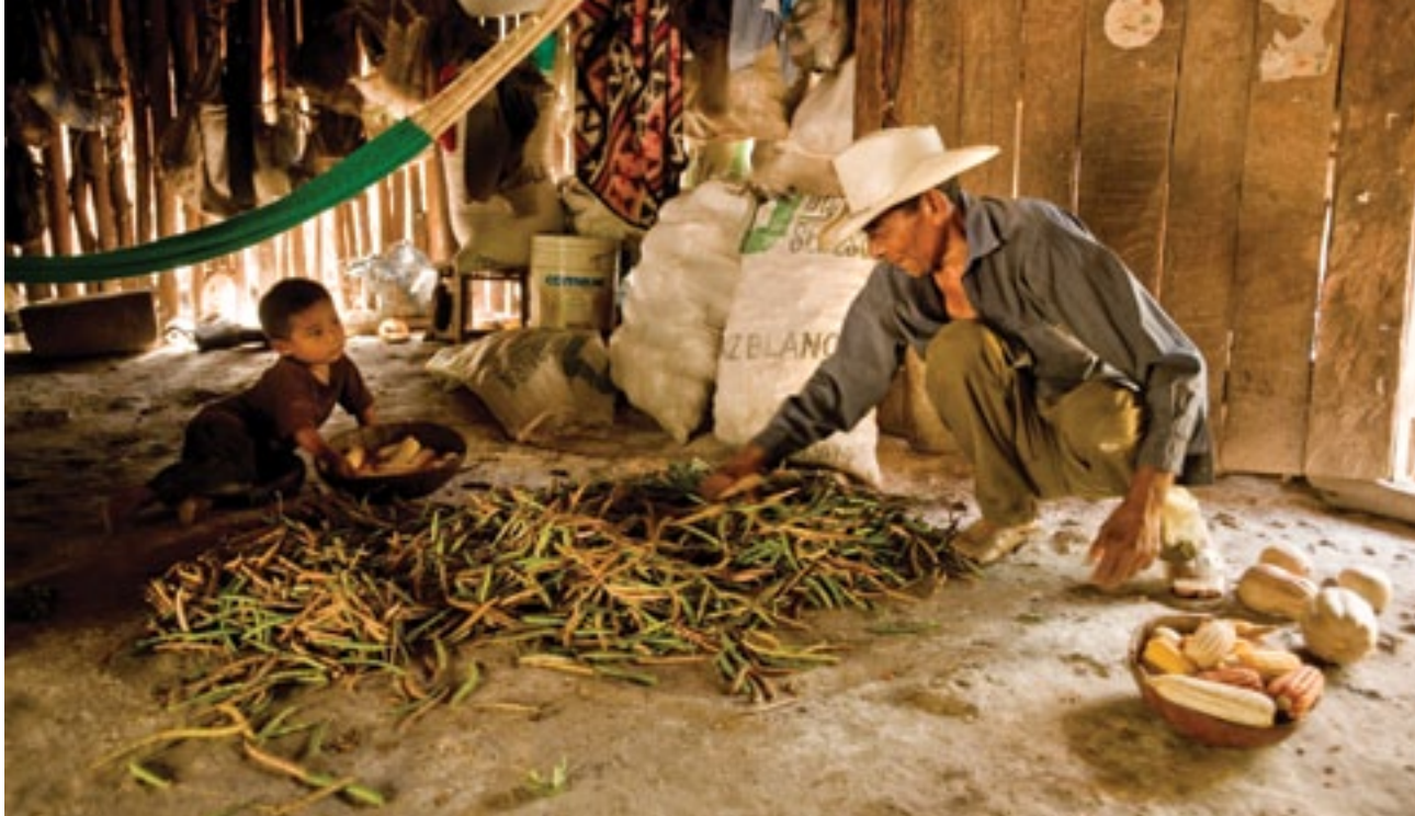
An indigenous man sorts beans at the ejido Veinte de Noviembre in the lush Maya Forest of Mexico's Yucatan Peninsula.