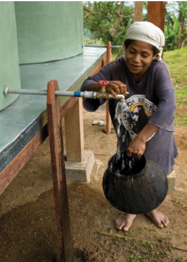
A villager gets freshwater for cooking from a rainwater collection unit in the small village of Turutapa in the Adelbert Mountain Range of Papua New Guinea's Madang Province. Turutapa, which can only be reached on foot, installed the storage tanks with the help of The Nature Conservancy, relieving the villagers of the need to walk long distances to collect freshwater.