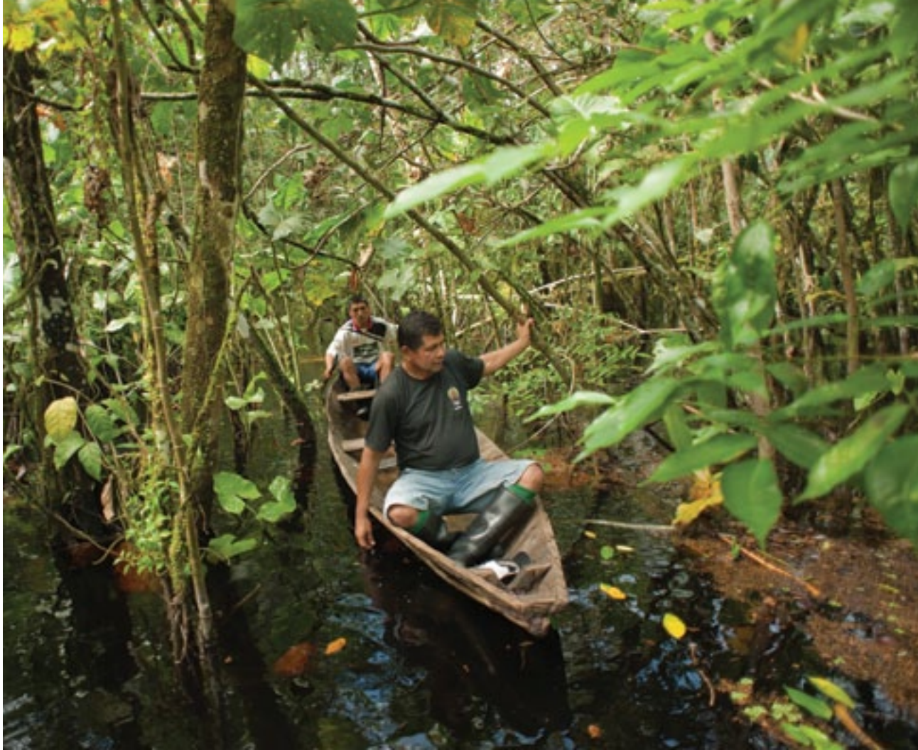
Men traverse Brazil's Amazon rainforest in a canoe.