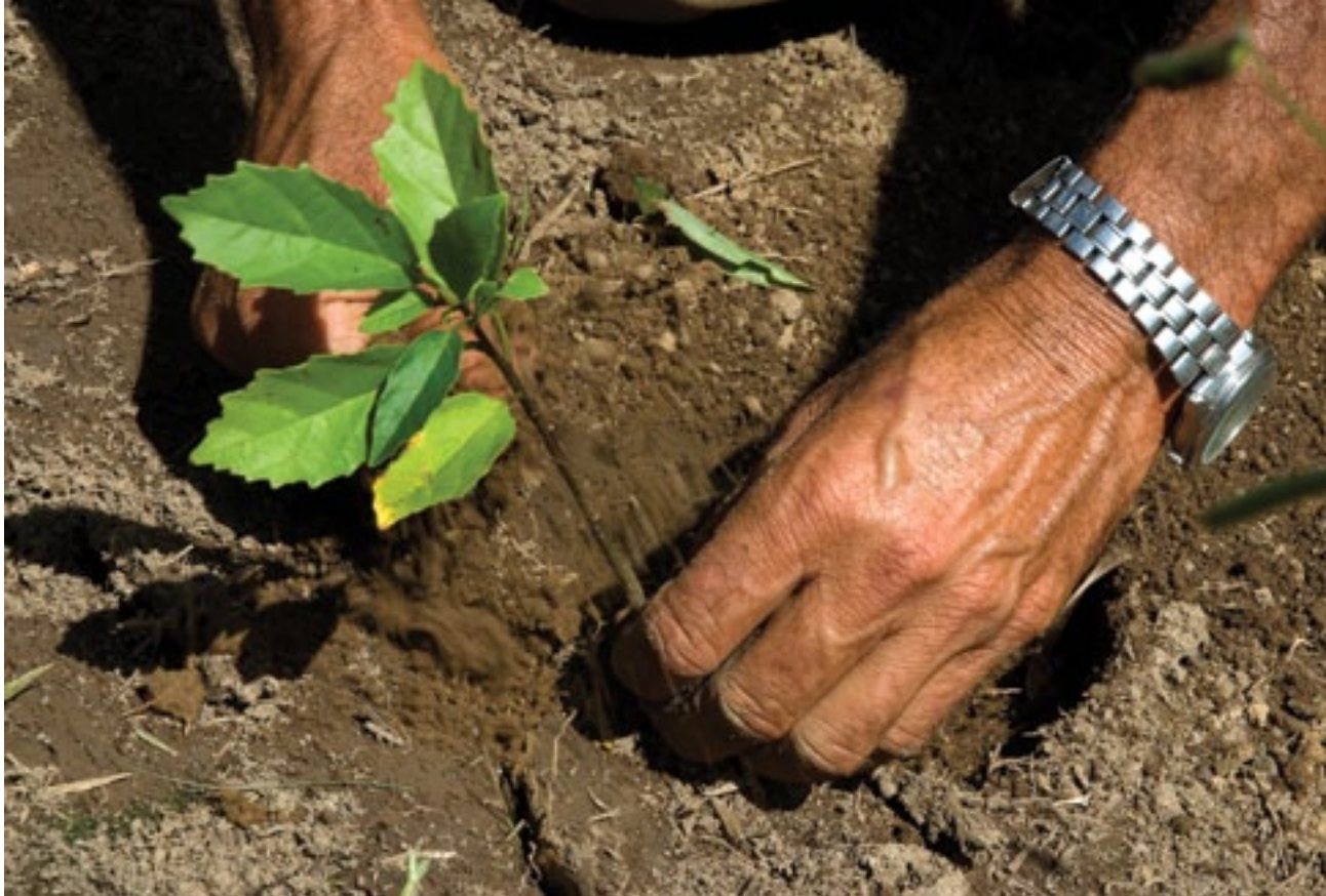
Tree-planting as part of reforestation efforts in Brazil.