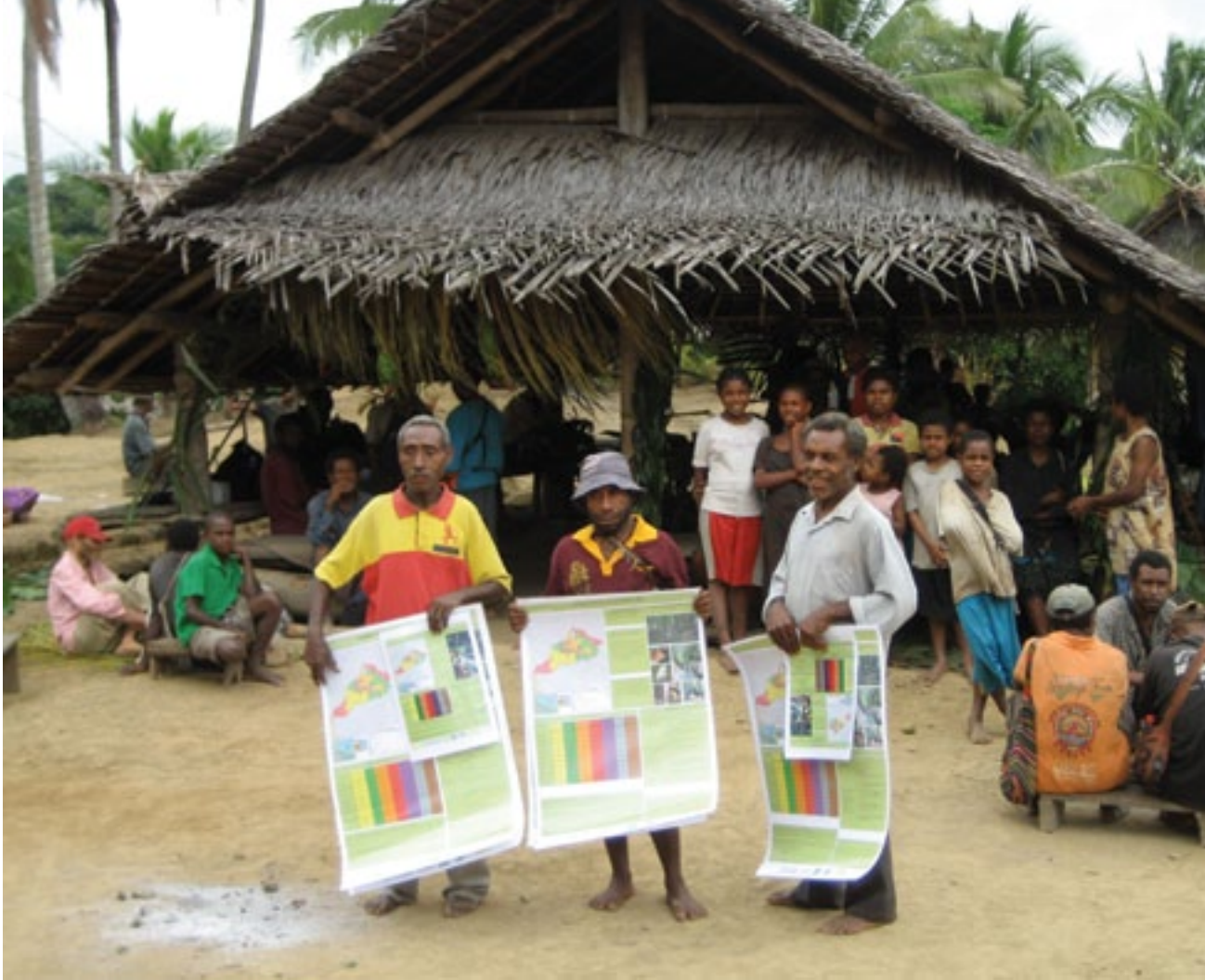
Three clan leaders in the village of Urumarav, Papua New Guinea, with their official land use plans and maps.