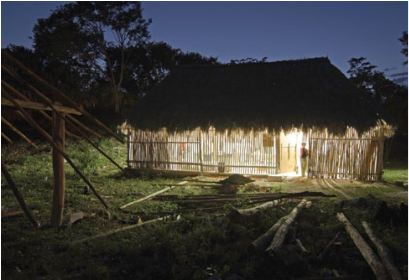
Members of the Bethania ejido, a communally-owned territory in Quintana Roo, México, have built a carpentry shop to turn their sustainably-harvested wood into finished products to sell.