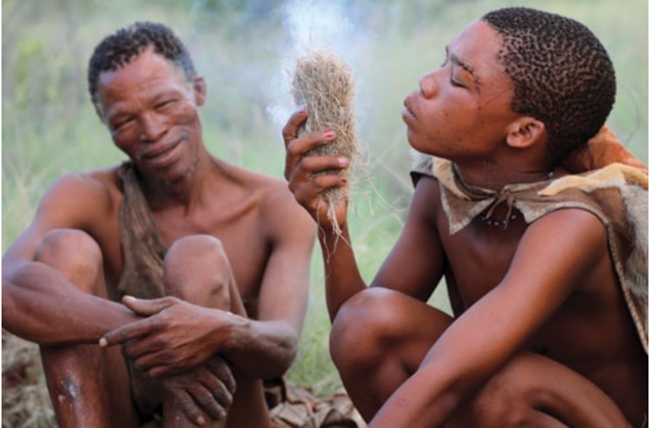
The Bushmen tribe in Botswana are hunter-gatherers, and the oldest inhabitants of southern Africa.