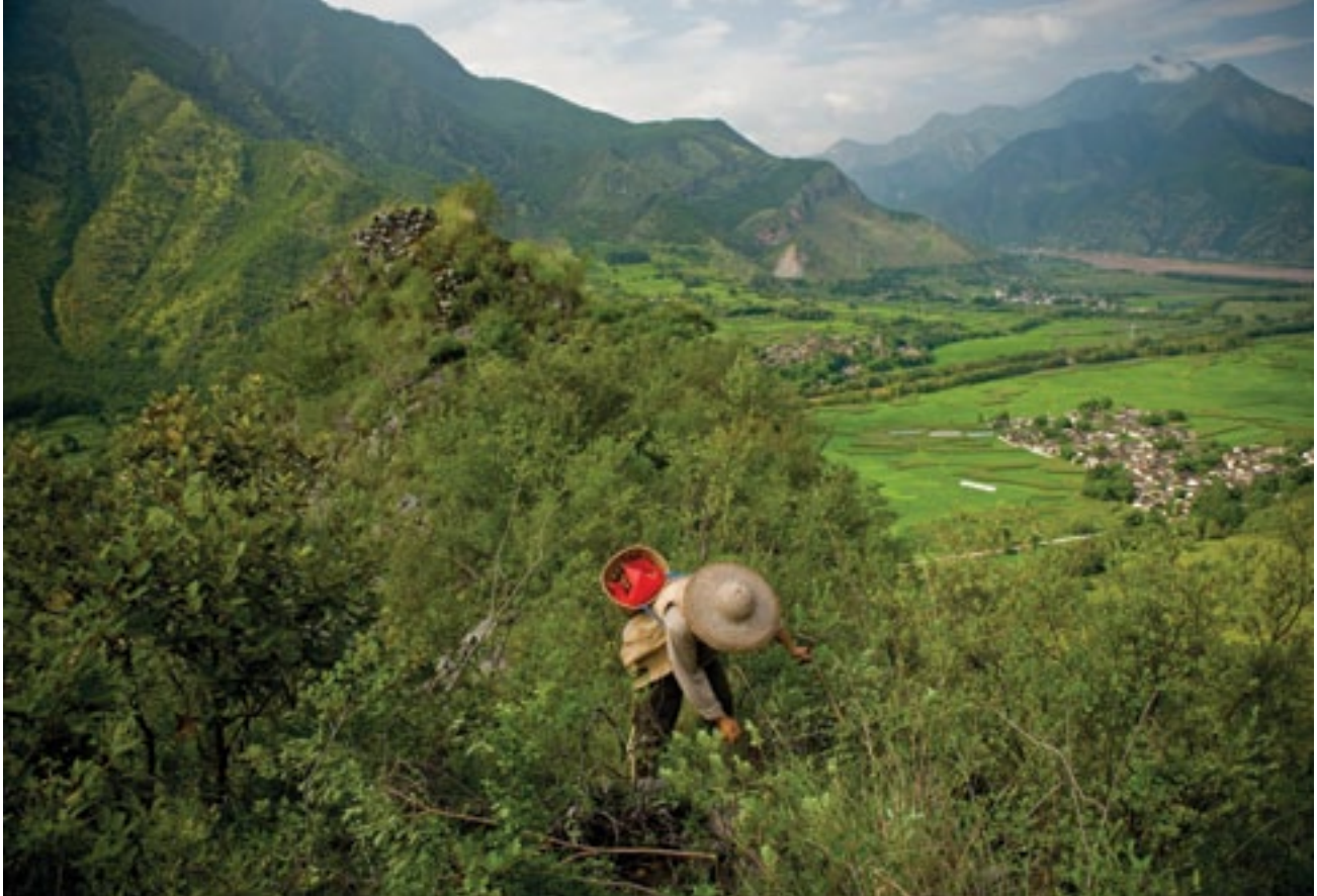
A resident of Yunnan Province, China, gathers mushrooms and berries while hiking in the fields and forests that line the Yangtze River.

R EDD+ programs can benefit from the decades of programs aimed at deploying resources to facilitate natural resource management and rural development.