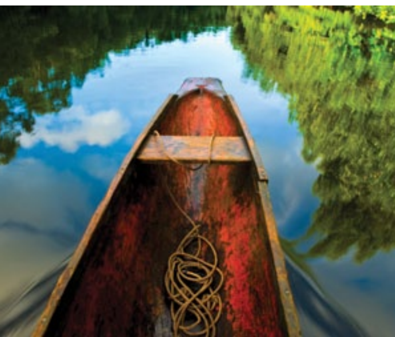
The bow of a dugout canoe glides through coastal waters where land and sea intertwine in a tangle of mangrove forests that encircle the islands of Micronesia.

Targeting is the process of directing incentives to specific actors to motivate them to undertake activities that contribute to program goals. Targeting helps to maximize desired results when resources are limited and can be used to enhance a mechanism's effectiveness at achieving its goals and purpose, whether those are defined by emissions reductions, area conserved, poverty reduction or number of people benefiting from the mechanism.