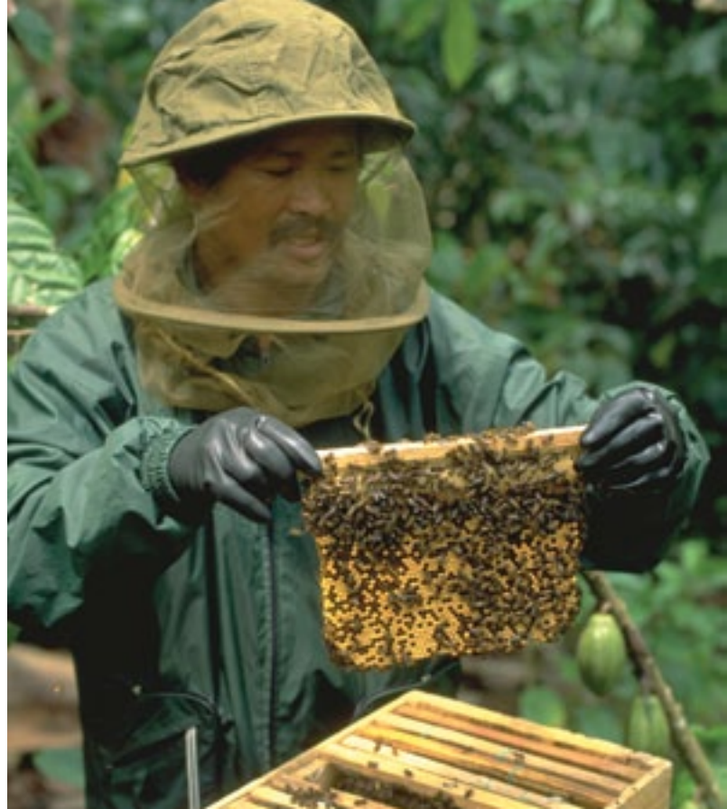
Beekeeping is a micro enterprise in Kamarora, Sulawesi, Indonesia.

KDP's primary expense (80 percent) were the community block grants delivered to participating kecamatans, which ranged in value from US $55,000 to US $110,000 (grant amounts are set to varied levels ultimately based on a sub-district's population density) (World Bank 2007). To obtain a block grant from their respective kecamatan government, villagers within participating kecamatans undertook a participatory process to design proposals to compete for funds. To do this, workshops were first held at the village level to disseminate information on the program. Villagers then elected two facilitators (one male and one female) to assist with planning. These facilitators held multiple meetings (including some for women only) where villagers discussed development priorities. Through these meetings, villagers prepare proposals for an "open-menu" of any productive investments, e.g. road and bridge construction, sanitation, the repair or extension of service facilities, and the like.