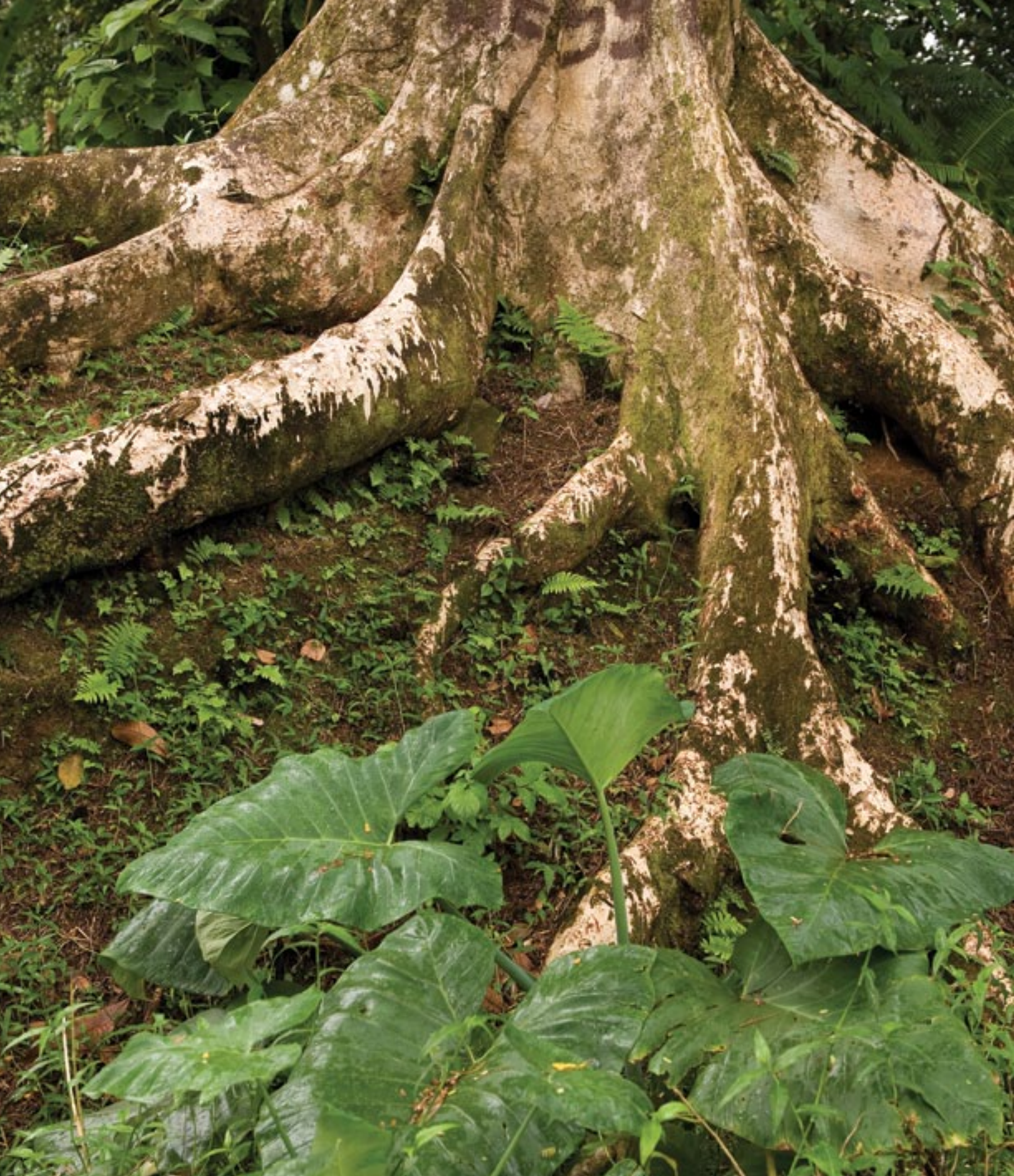
Coastal forests encircle the islands of Micronesia.