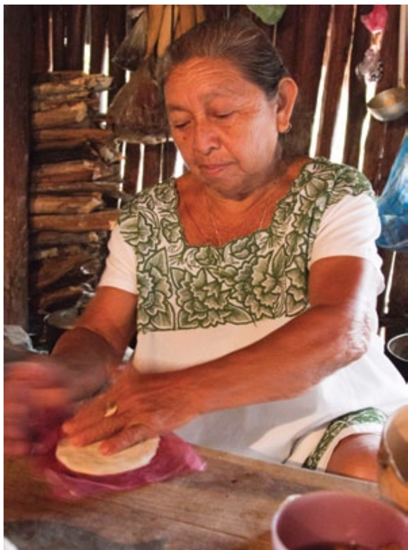
In Bethania ejido, Quintana Roo, México, where many families cook their food over an open fire in traditional thatched-roof homes without running water, The Nature Conservancy has worked with partner Organización de Ejidos Productores Forestales de la Zona Maya S.C., to support sustainable forest management and income-producing activities.