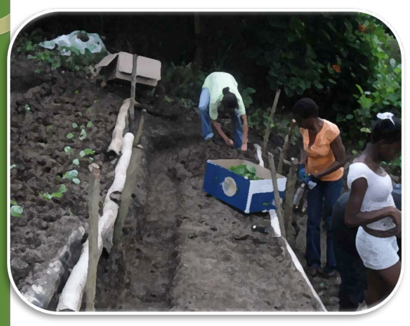
Terracing to reduce erosion