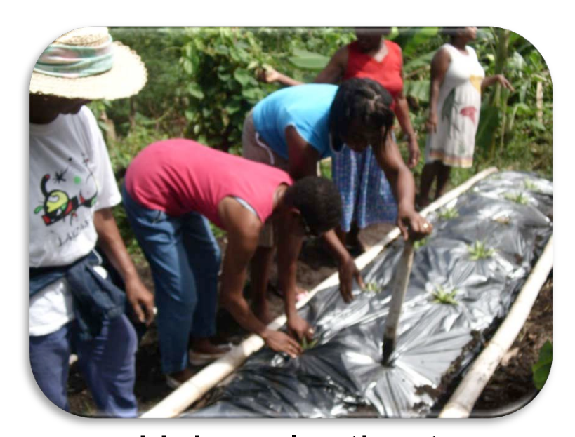
Using plastics to control weeds