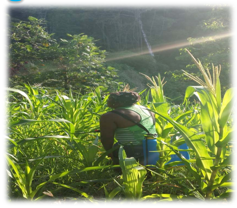
Organic Pesticides used on the farm

Organic pesticides made from household products