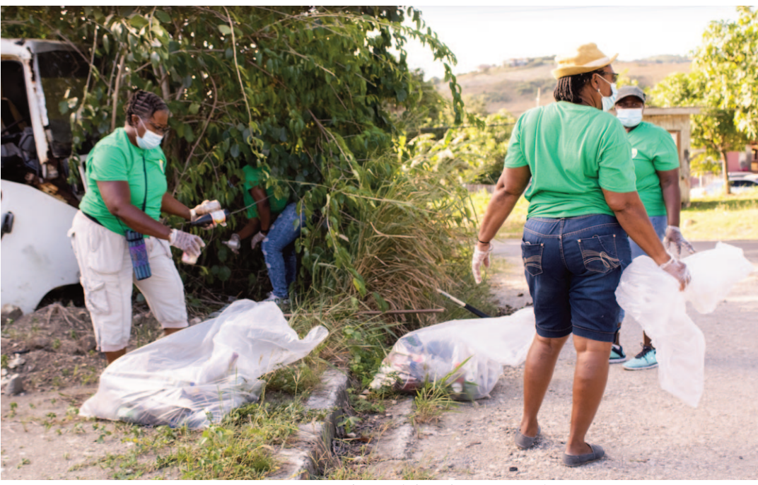
Swetes community cleanup