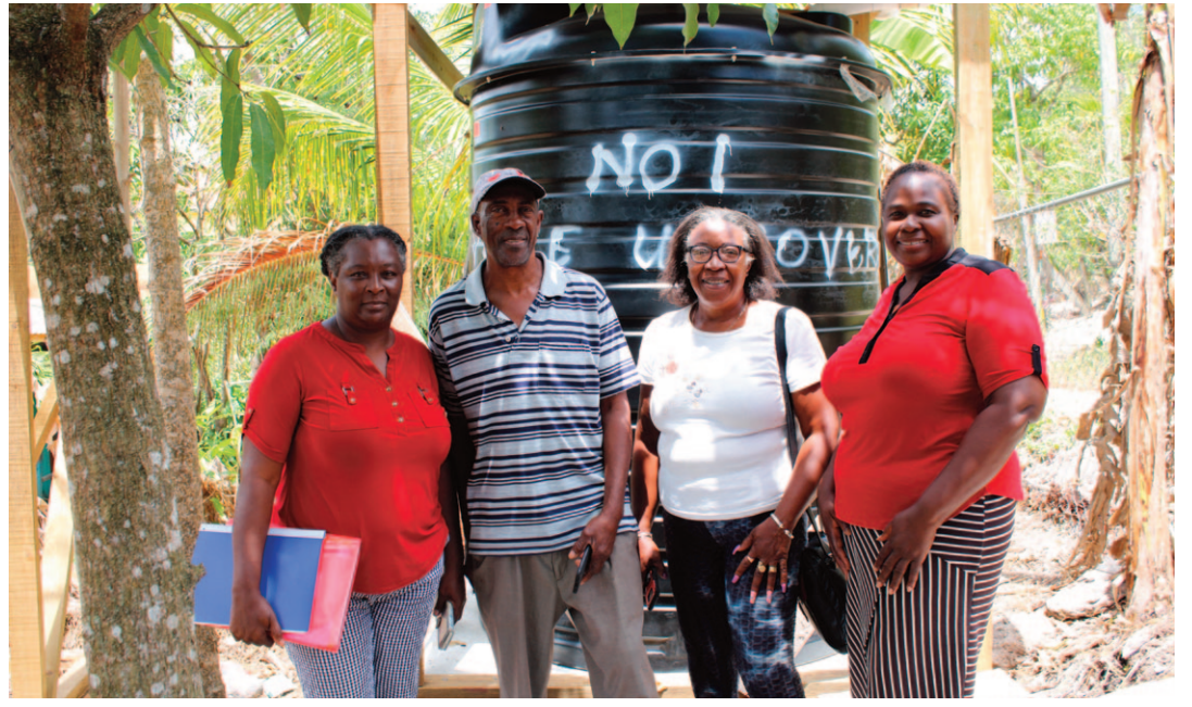
Project team at the project headquarters, pictured with one of the 1,000-gallon tanks, 10 of which were donated to vulnerable homes