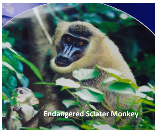
Endangered Sclater Monkey

In addition to the environmental damage stemming from the illegal wildlife trade, this is also a financial crime, generating about $9 billion per year in illicit profit and, money that finds its way into the hands of criminal gangs and violent insurgent groups. “As a direct response to this calamity, the GEF has redesigned its funding strategy for the next four years to step up its support to stamp out illegal wildlife trafficking. We will make significant funds available to support strengthening national and site-level monitoring and enforcement capacity. More importantly, we will also work on reducing consumer demand for illegally traded wildlife,” said Dr. Naoko Ishii, GEF CEO and Chairperson.