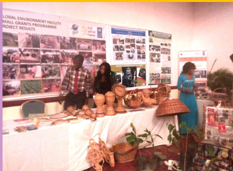
Exhibition Materials @ the Fed. Min. of Env.

The GEF-SGP has established a permanent exhibition stand at the Brown Building