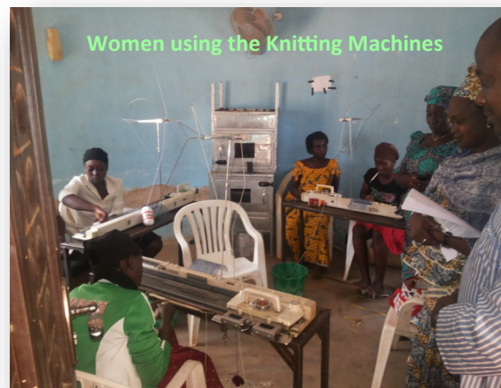
Women using the Knitting Machines

Kafanchan Zumi Womani Credit and Marketing Cooperative Society, a faith based organisation which seeks to help widows/victims of communal conflict in Southern Kaduna. The beneficiaries have been trained in livelihood skills such as sewing, knitting, catering and shoe making. An initial skill acquisition centre was enhanced through SGP support while a new one was established in Kamurum community to reach more of beneficiaries. Each of the trainees has in turn trained at least two other people having been enjoined to train others as a responsibility of being the first beneficiaries. One of the communities donated over a hectare of land and 97 economic trees have so far been planted while many will be planted during the next raining season. Over 200 energy saving stoves, lanterns and water filters have been given