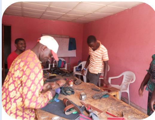
Trained Shoemakers at the Skill Acquisition Centre

Over 300 widows, youth and other vulnerable people have been empowered in not less than 25 communities in 7 Local Government Areas of Kaduna State through the “Sustainable Land Management and Alternative Livelihood” project being implemented by