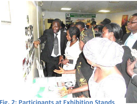
Fig. 2: Participants at Exhibition Stands

SGP also organized the first exhibition of her projects during the workshop to showcase some of the products/results of SGP projects in the country. Over 20 grantees participated and several SGP products were on display. The various products displayed during the exhibition included herbal products, craft works, irrigation pitchers, products from Nypa palm such as ethanol and fronds, energy saving cooking stoves, tree seedlings, improved agricultural products produced using composting among others.