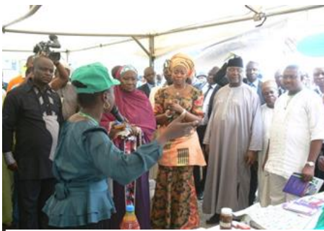
Fig. 4: SGP exhibition applauded by dignitaries

The increasing impact of SGP activities in Nigeria cannot be over emphasized. GEF-SGP impact was again recognized and applauded by the First Lady of Benue State, Mrs. Yemisi Doshima Suswan; the Deputy Governor, Stephen Lawani (OFR?); Benue State Commissioner for Environment and other dignitaries at her exhibition stand during the 8 th National Council on Environment (NCE) meeting held in Benue State between the 5th and 10th, May 2013 where only 10 SGP grantees showcased some of SGP products and projects results.