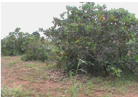
Fig 10: Thriving Orchard on degraded land with pitcher irrigation

Environment and Development Foundation (EDF): SGP Nigeria supports simple pitcher irrigation to raise tree seedlings in woodlots to reduce deforestation and produce fruits in orchards. Vegetables were grown in the orchard before the fruit trees reach maturity. Pitcher irrigation is similar to drip irrigation technology but without the sophistication and costs. It involves the burying of specially made porous earthen pots neck deep into the ground. The buried pots are filled with water and covered with a lid to prevent evaporation. The water seeps out from the wall of the pots gradually to wet the surrounding soil and may not be refilled for up to 2 weeks depending on the size of the pots. This simple