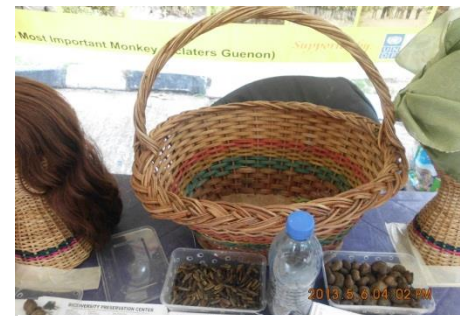
Fig 6: Products on display during exhibition