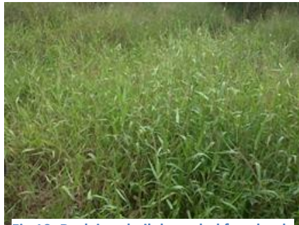
Fig 10: Reclaimed oil degraded farmland

Initiative for Community Development (ICD): One of SGP projects in Delta state facilitated the use of indigenous plants to reclaim farmlands along pipelines degraded by oil spill. This has resulted in reclamation of about 1/5 of farmlands of Emede in Isoko LGA of Delta State. The NGO has also trained other NGOs to support other communities to deploy the simple remediation technology while Delta State government has commissioned the NGO to replicate the project in other affected communities.