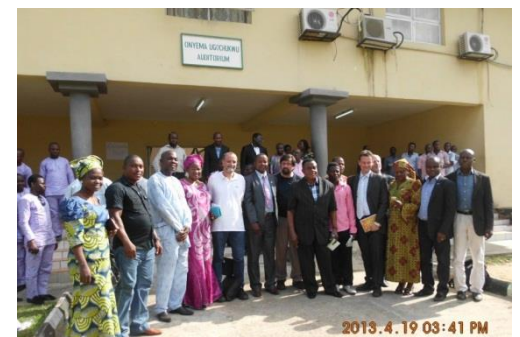
Fig 7: Cross section of organisers & resource persons

a. International Seminar on Community-Based Conservation of Endangered Sclater's Monkey ( Cercopithecus sclateri ). GEF-SGP Nigeria National Coordinator was a Resource Person at the first International Seminar on Community-Based Conservation of Endangered Sclater's Monkey ( Cercopithecus Sclateri ) which was organized by one of her grantees (Biodiversity Preservation Centre) in collaboration with the University of Uyo, Akwa Ibom State, Nigeria. It was a well-attended meeting with other resource persons from Nigeria and Rome, Italy. The meeting underscored the importance of conservation and especially scientific and fact based conservation, indigenous participation and political will in order to make a great positive impact in conservation. Some of the endangered species of animal endemic to Nigeria and Akwa Ibom in particular were highlighted and there was a general call to the academic/research institutions, donors and corporate organisations for concerted effort to prevent total extinction of these species.