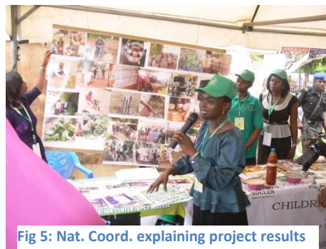
Fig 5: Nat. Coord. explaining project results