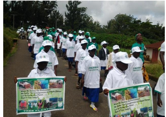
Fig 9: Participants during World Environment Day Rally

e. GEF-SGP Grantees Workshop: In effort to make project implementation more effective and promote better understanding of stakeholders’ role, GEF-SGP organised a workshop for all her new OP5 grantees early this year. Some of the issues discussed were understanding of the requirements of the MOA, community engagement, technical and financial report writing, knowledge sharing, resource mobilization partnership building and mentoring. The aim was to remove or reduce the hitches usually associated with project implementation and misunderstanding of the requirements of the signed MOAs. Over 30 participants, including old and new grantees participated at the workshop. All the participants attested to the importance of the workshop and the increased knowledge gained to help them to effectively deliver on the projects.