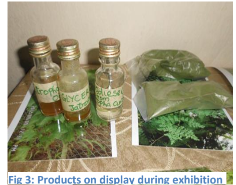
Fig 3: Products on display during exhibition

SGP also organized the first exhibition of her projects during the workshop to showcase some of the products/results of SGP projects in the country. Over 20 grantees participated and several SGP products were on display. The various products displayed during the exhibition included herbal products, craft works, irrigation pitchers, products from Nypa palm such as ethanol and fronds, energy saving cooking stoves, tree seedlings, improved agricultural products produced using composting among others.