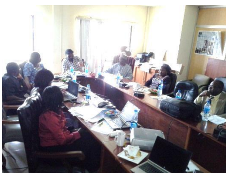
Fig 8: NSC members at the 8th NSC meeting

b. GEF National Steering Committee Meeting: GEF-SGP Nigeria, as a member of the Nigerian National Steering Committee of the Global Environment Facility was at the last NSC meeting where the National Coordinator made a presentation on the status and success stories of GEF-SGP, explained the importance of collaboration with other GEF Full Size and Medium size projects and promised to work more with other projects to achieving synergy for greater success of GEF projects and programmes in the country. All other project contacts agreed and expected SGP NC for further discussions on the way forward.