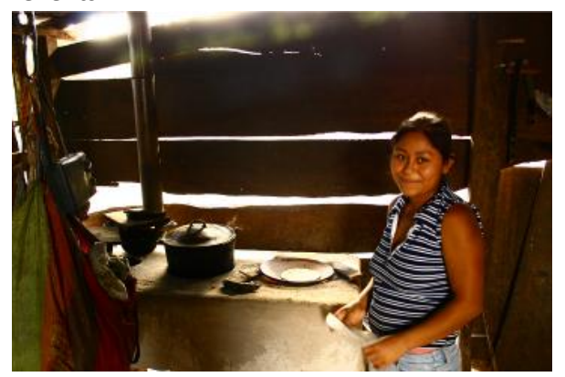
CETA modified cook stove

The technology enables communities to lower firewood consumption and therefore reduce deforestation. In Nicaragua, excessive use of firewood is a serious issue for the environment. SGP Nicaragua has thus placed great emphasis on helping to improve environmental conditions in the dry areas such as Apante Hill by supporting energy efficient cook stove projects and by establishing energy forests for sustainable firewood supply. The government has also acted on the serious deforestation issue and launched a National Strategy for Firewood and Charcoal (2011-2012). SGP Nicaragua is one of the government's partners to support the implementation of the strategy.