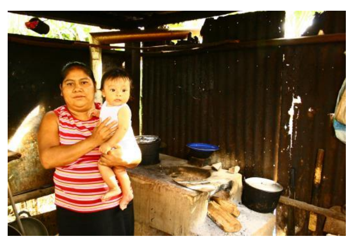
Families enjoy indoor cook stoves with ventilation, eliminating smoke

The energy efficient stoves improved living conditions in participating households. For one, 15 environmental activists were trained in the construction and maintenance of the stoves. This skill has provided them with the opportunity to earn additional income. Moreover, the eco-stoves require 50% less