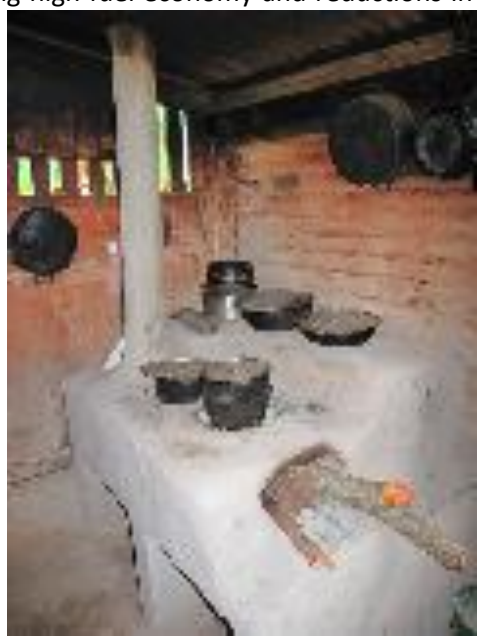
CETA Modified Eco-Stove

SGP Nicaragua's intervention point was to support the dissemination of the efficient stove, and help the women refine the stove model to suit their own local, traditional kitchens. The "know-how" of the stove technology was initially transferred through "train-the-trainer" concept. Initially, 4 environmental promoters were trained by a local NGO who then trained another 11 women in the construction of the stove through a workshop. Much learning rested on "learning by doing" (tacit learning). The women trainees, who were selected by their communities, then built and replicated the stoves for other households in their communities. Relatives and other beneficiaries joined in at the stove building.