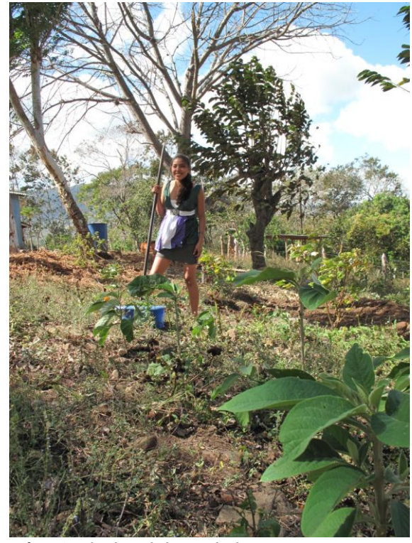
Reforesting the degraded watershed area

The proposed efficient stove technology was accepted by the beneficiaries because they were also introduced to various practices for sustainable natural resource management through workshops held by the Ministry of Natural Resources. More than 300 community members became more aware of the importance of sustainable forest management, learning about environmental protection; techniques for reforestation and crop diversification to relieve pressure on forest degradation; and pollution prevention of the principal watershed of the protected area. The increased awareness motivated participants to rehabilitate the forest. Giving priority to reforestation in the river areas, the project participants managed to plant more than 6,000 tree seedlings covering 4.3 hectares of degraded forestland in the main watershed area. One part was reserved as an energy forest.