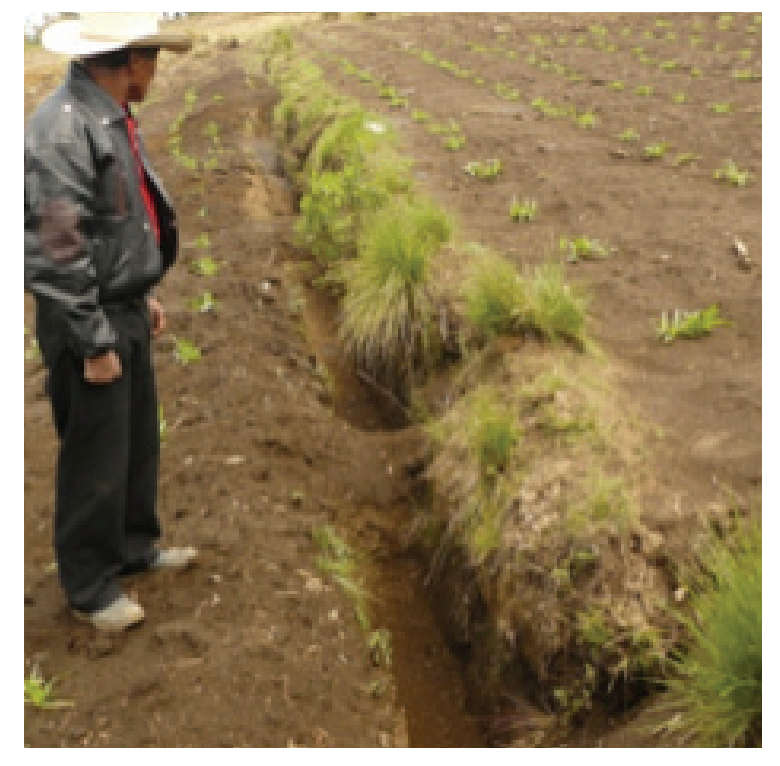
Ditches are established to water retention for crops and soil preservation.

Two CBA projects in Guatemala were implemented to develop the capacity of communities to adapt to climate change by integrating climate risk management practices into community management of agro-ecosystems, forest ecosystems and watersheds. Both projects were located in the department of San Marcos, the third most densely populated region in Guatemala (based on the 2002 population census, with 794,951 inhabitants). The dense population in the area was causing severe contamination of the Rio Suchiate and Coatan tributaries, as well as pollution of water basin resources. The loss of water basin resources, which were contaminated, led to an alarming reduction in soil vegetation cover and rising evapotranspiration in the region. These impacts, which are associated with population pressures, increased erratic rains. As a result, delayed rainy seasons and intensified rainfall periods (when they occur) caused increased runoff and sediment that moved upstream in the basin. The volume of sediment moving upstream was increasing to unmanageable levels. The forest remnants and the soil conservation practices present in the middle of the basin were unable to absorb the large quantities of sediment.