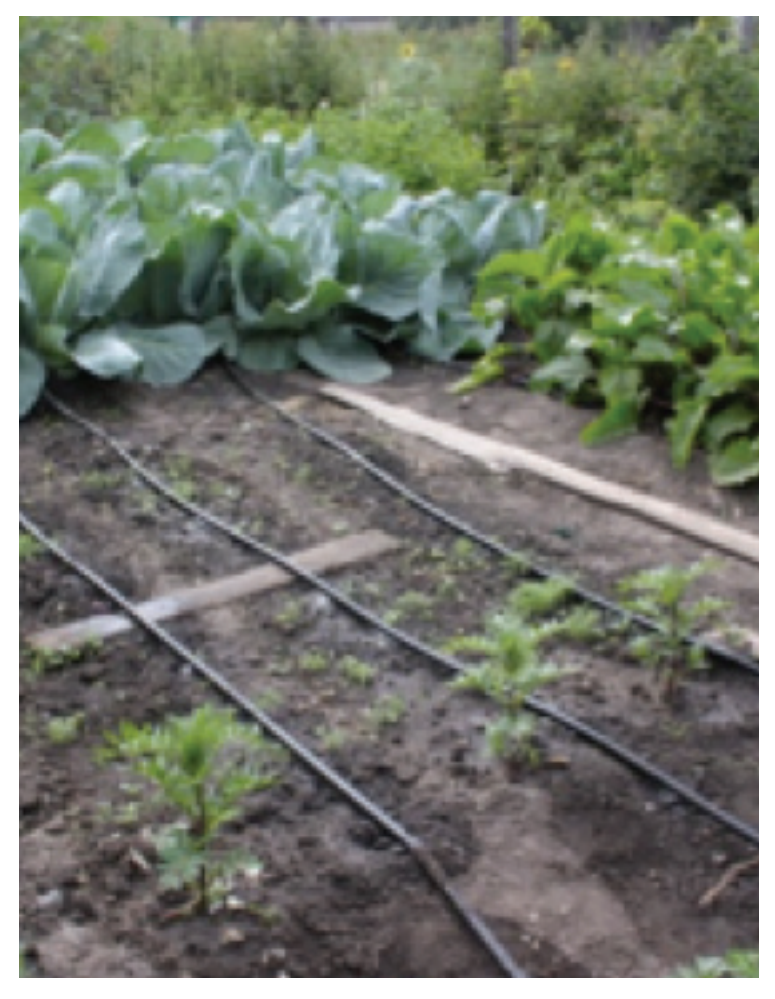
Innovative water-saving irrigation technologies such as drip irrigation, installed in local communities' backyards have led to increased yields.

Other economic benefits from the new technology and expanded winter wheat and cereal crop varieties included increased crop yields (by 15 percent) and in producers' incomes (by 30 percent) compared to pre-CBA project income levels in 2008.