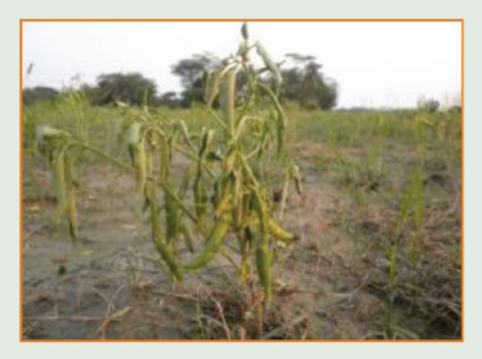
Before the CBA Project: Sesame and Chili damage due to heavy rainfall and water.

Mariom was an active member of the Lohalia WRC at Purbo Alipur village where she attended weekly workshops given by project personnel and Upazila assigned officials. In the workshops, she learned which climate-resilient crops to plant in her land, and she was also given support and training on advocacy, vegetable gardening, livestock, agriculture, maternal and child health and individual and family health.