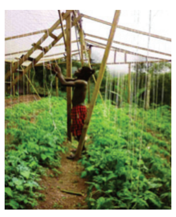
Participant tending to crops in greenhouse.

The community members were empowered to share the results of their work. As a result, they have shared experiences and knowledge and impacted approximately 250 additional people in neighboring communities. This figure is expected to increase as farmers continue to benefit from farmer-to-farmer knowledge, become better acquainted with the technology, and apply necessary adjustments to achieve full efficiency.