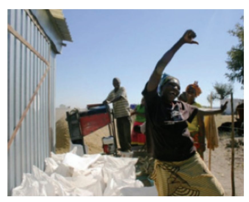
Siya Group members celebrate pearl millet harvest. Other CBA groups are replicating the group's success.

This project focused on mobilizing community members through the creation of Self Help Groups (SHG) and by building the communities' awareness on issues such as climate change, coping strategies and nutritional needs. The SHGs helped community members to take charge of their own development and financial well-being such as savings and lending.