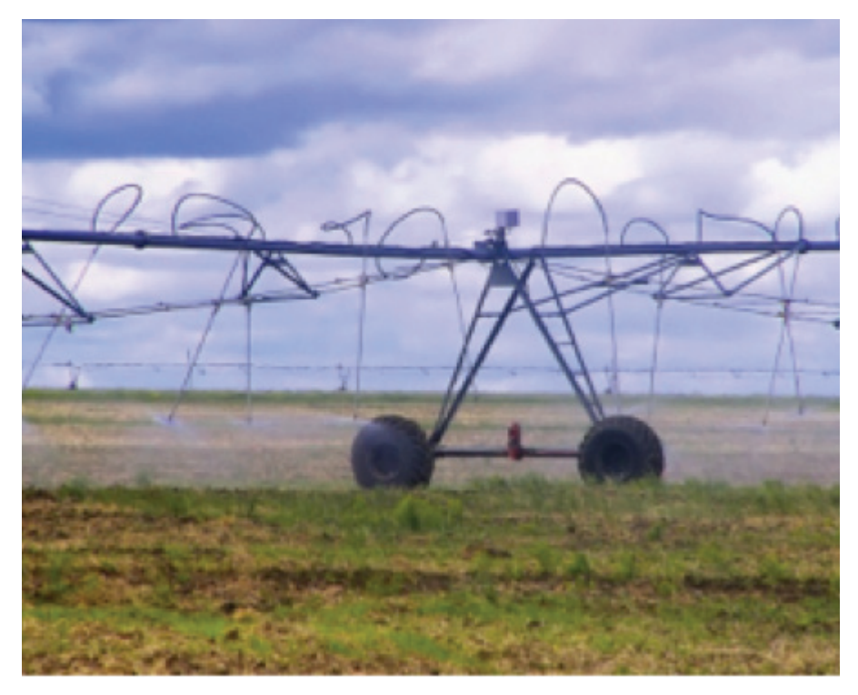
Irrigation machineries with spaying nozzles for near-surface irrigation

The development of the area's climate change adaptation strategies was done after careful consideration of the village's problems. The strategies focused on two areas: rational land resources management, and rational use of water resources. For crop and wheat production, planting of drought-resistant crops of winter wheat was implemented based on topography.