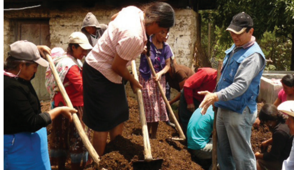
United Nations Development Programme