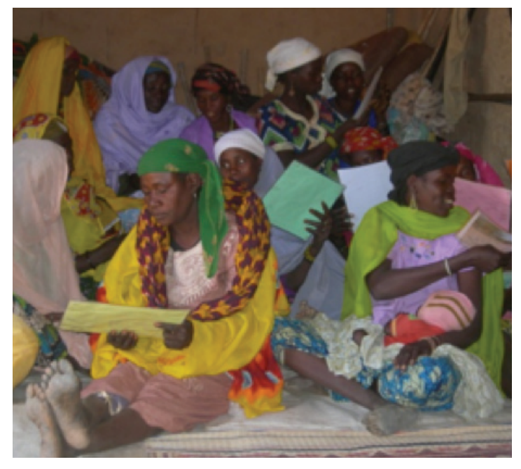
Training session in Tamalolo on drip irrigation techniques.

The market gardening introduced by the project improved food security and diversified income-generating opportunities for women. This improved their adaptive capacity by minimizing impact from the loss of a single source of income, improving business skills, and providing a way to purchase food when crop stores are low. The ability to earn money also increases the autonomy of women.