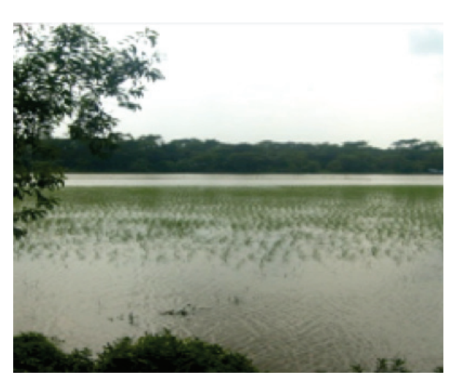
Flooded lands in Dashmina Upazila

This project introduced seed banks² to protect climate-resilient crop genetic materials that would otherwise be washed out by storms and floods. This enabled the community members to maintain their self-sufficiency in food grain production. Concurrently, workshops on quality seedling management and nursery techniques were provided for the development of tree nurseries and plantations. The tree nurseries and plantations conserved plants used for wetland replanting programs and for establishing green protection belts that hold back cyclones and storm surges. As a result of the development of seed banks and tree nurseries, agricultural biodiversity product yields have increased in the project area. They provided many benefits: they produced local fruit plants to supplement the nutritional demand, provided food for birds and wildlife, and produced saline-tolerant saplings in response to increased saltwater intrusion in the area.