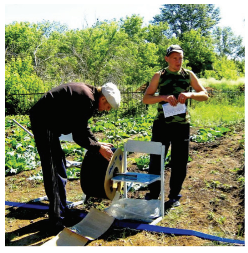
Drip Irrigation systems being installed in local community backyards.

Arnasay winters are long, cold and characterized by heavy winds; and the summers are hot, with droughts and heavy rains. Due to climate variability, winter seasons have become shorter and summer seasons longer and dryer. This poses a significant problem for Kazakhstan and other Central Asian countries because only water from snow melt, and not summer rain, hydrates the soil. Additionally, the harsh climate conditions have increased soil erosion and land degradation, which has reduced farmers' production and incomes, thus hurting the local economy. In some cases, these conditions have forced local community members to migrate.