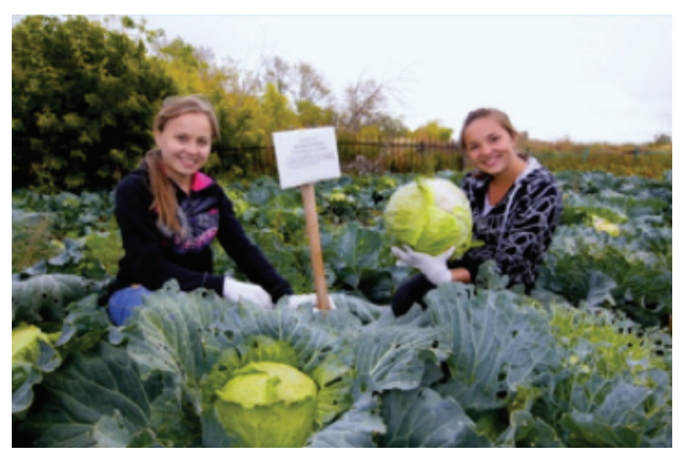
The yield of cabbage grown by locals via drip irrigation system usage. Children help in yield gathering.