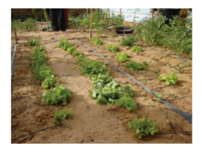
Drip irrigation.

Farmers were also trained in farming techniques to intensify agro-silvo production. Zai, half-moon and stone-line farming technique, which can be used on uncultivated land, was applied to restore degraded soils. As a result, 3,000 meters of millet stem chords were produced, which protected farmlands from sand cover and violent winds. This layer of protection also helped to maintain agricultural fields to preserve long-term soil health.