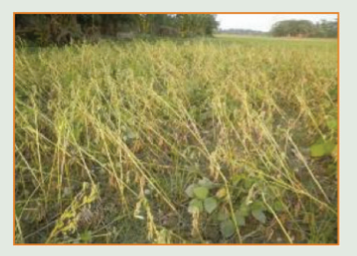
With the CBA Project: Climate-resilient crops are cultivated in community tree nurseries and in local homes.