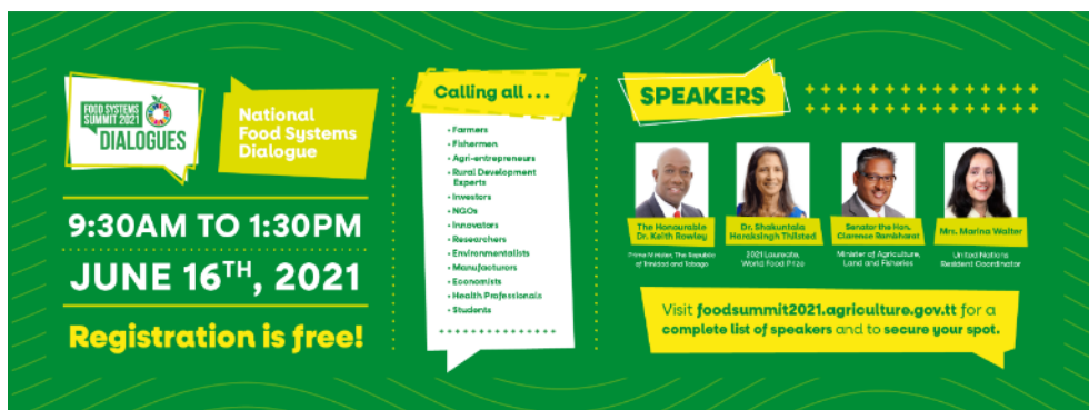
Picture 13: Flyer for the Food Summit which was widely shared on social media.