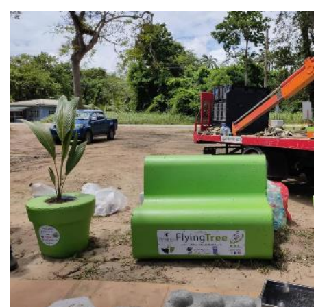
Picture 10: Ground dirty, waste plastic found on beach Picture 11: Participants shovelling the concrete and plastic mix from the ransom into the paver mould. Picture 12: An example of the completed product. Picture 13: Bench and pot donated by FTEM and now on Moruga Beach.