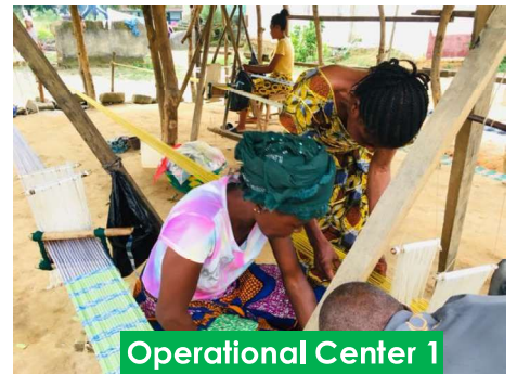
Operational Center 1