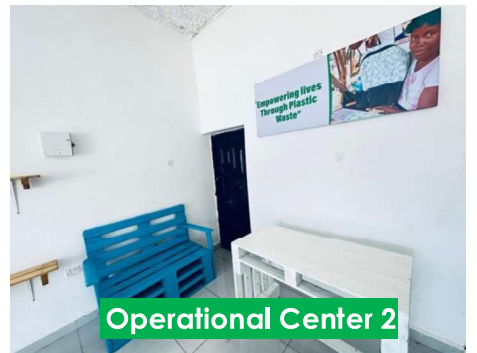
Operational Center 2