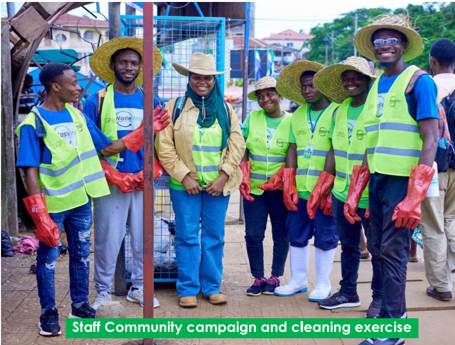
Staff Community campaign and cleaning exercise