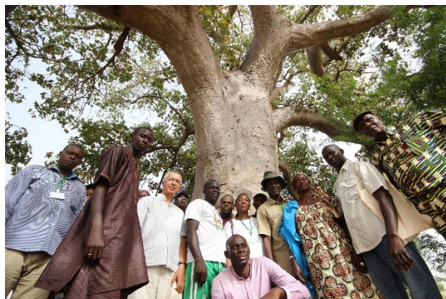
Workshop participants gather by a sacred tree in the Gnit ICCA.

The 5-day workshop focused on examining the challenges and opportunities of ICCAs in five countries: Benin, Guinea, Guinea Bissau, Morocco and Senegal . It began with an official symbolic ceremony administered by local administrative authorities and covered by a television network (2STV). Approximately 36 multi-level stakeholders actively engaged in knowledge-exchange and capacity building sessions, including site visits to two ICCAs. The participants included representatives of IPs and local communities who govern and manage ICCAs, government agencies responsible for governance and natural resource management, civil society organizations (CSOs) and academia. Representatives of