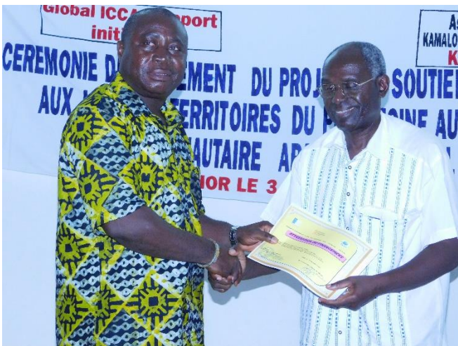
President of the KABEKA Sénégal NGO receives the catalytic grant from SGP to support the launch of the ICCA-GSI project in Senegal.

proliferation in the Diama dam 1 , which now occupies a 130-kilometre stretch of the river, blocking irrigation channels, reducing access to the river for livestock farmers and fishermen and colonizing fragile ecosystems. To this end, the communities in both ICCAs wish to protect and increase the efficiency of their ecosystems by being formally-recognized by the government. The Doune Kougue communities have received the formal recognition from the municipal authority and are in the process of developing sustainable fishing and agricultural measures to restore their ecosystems, and thus, increase its functionality and conserve biodiversity. The Gnit communities are still waiting for their lands to be recognized as a heritage site.