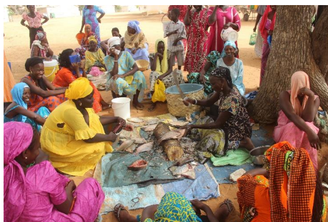
Fishing community of the Gnit ICCA

Subsequently, the participants were split into 2 groups to visit two different ICCAs for a hands-on learning experience, as well as a post-site visit information-exchange between the 2 groups. One group visited the Diar Marigot , one of the most fish-abundant marigots in the entire Saint-Louis region and livelihood source of fishing communities. The other group explored the Doune Kougue Island, one of the four enclaves of the Gnit ICCA located the east of Lake Guiers. This enclave is known for local transhumance and a place of safety for breeders and peasants with no threat from cattle theft. However, both ICCAs are plagued by typha