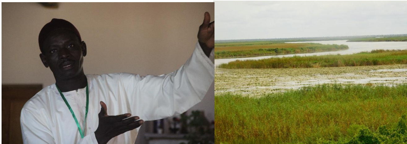
ICCA leader, left photo, explains the challenges in biodiversity and ecosystem functionality in their ICCAs brought on by the typha proliferation in the Diama dam (right photo).

ICCA-GSI partnership such as ICCA Consortium, IUCN Morocco and SGP National Coordinators from the 5 countries actively engaged with all participants.