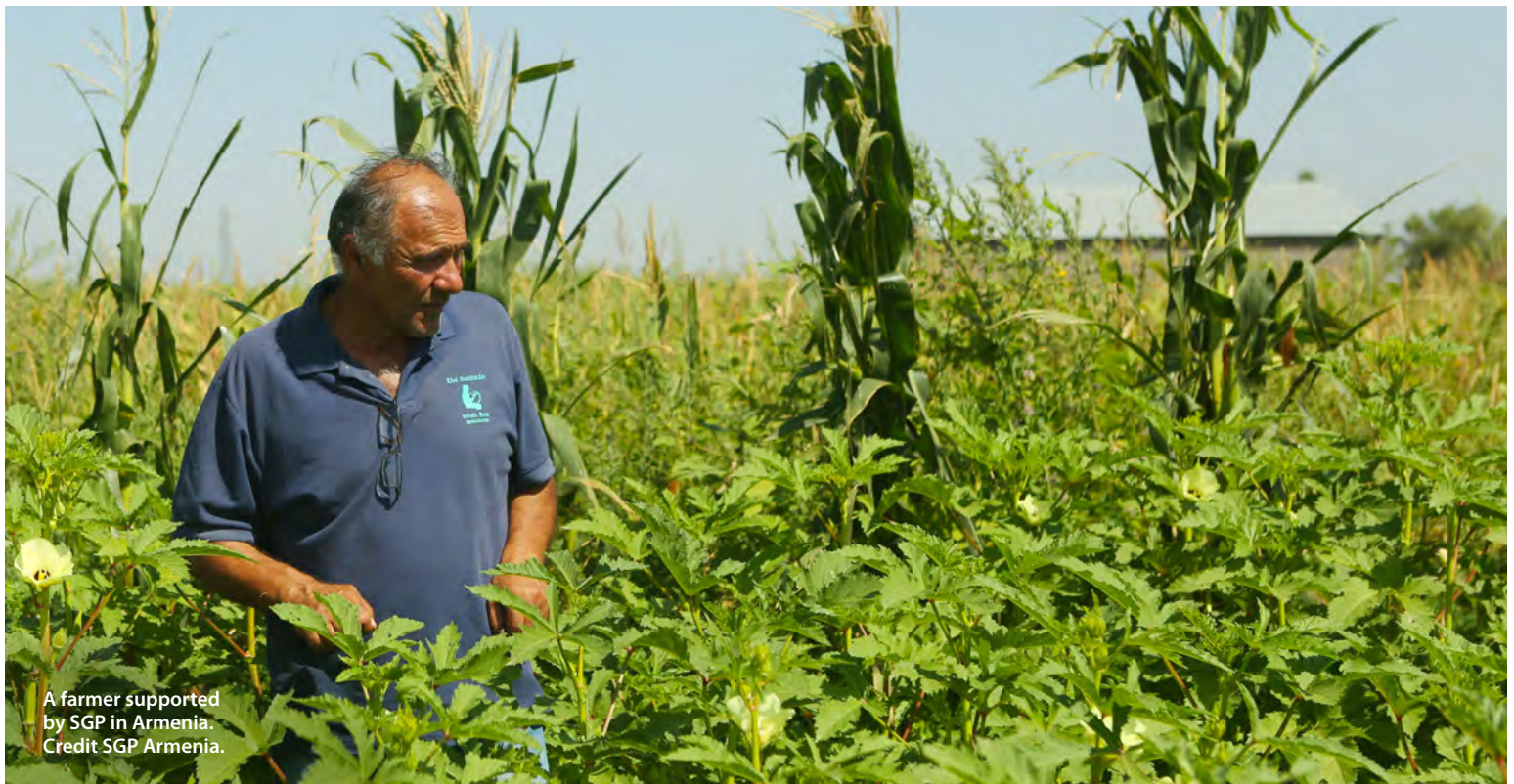
A farmer supported by SGP in Armenia.

In parallel, trainings on sustainable agricultural practices in the Ararat valley were organized in the Hayanist community. Through coaching and ongoing consultancies, the knowledge of the local farmers about sustainable land management practices was improved, to ensure successful operation of the system. The project findings were analysed to develop a strategy for replication and dissemination, targeting communities where installation and operation of similar systems was technically and financially justified.