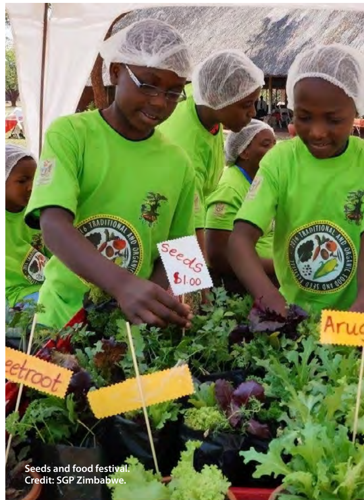
Seeds and food festival.

the base of sound land use practices and food production systems. The initiative targeted both urban and rural areas, and was based on the premise that children are capable, resourceful, and competent individuals who can be empowered to become active contributors and agents of change to face the social, environmental and economic challenges faced by the world today.