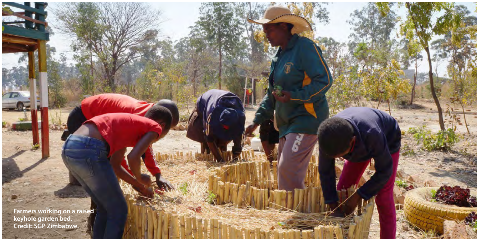
Farmers working on a raised keyhole garden bed.