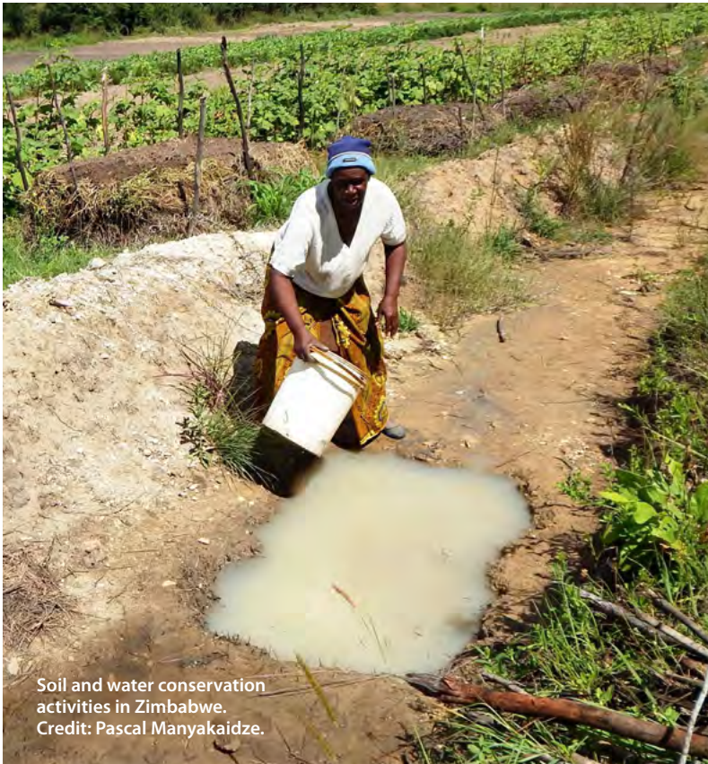
Soil and water conservation activities in Zimbabwe.

Support is provided for integrated projects that aim at restoring ecosystem services or reducing negative environmental trends such as land degradation and deforestation, biodiversity loss and emissions of greenhouse gasses. SGP supports community-based sustainable land management actions that integrate climate-resilient sustainable practices and standards (e.g. secure land tenure and community participation), while also promoting diversification and improved livelihoods. These actions include water harvesting, post-harvest management, and business skills development to empower communities to better manage their natural resources, which all also lead to global environment benefits. SGP supports national and local efforts to address the challenge by supporting work towards land degradation neutrality (LDN), applying the LDN framework of the United Nations Convention to Combat Desertification (UNCCD).