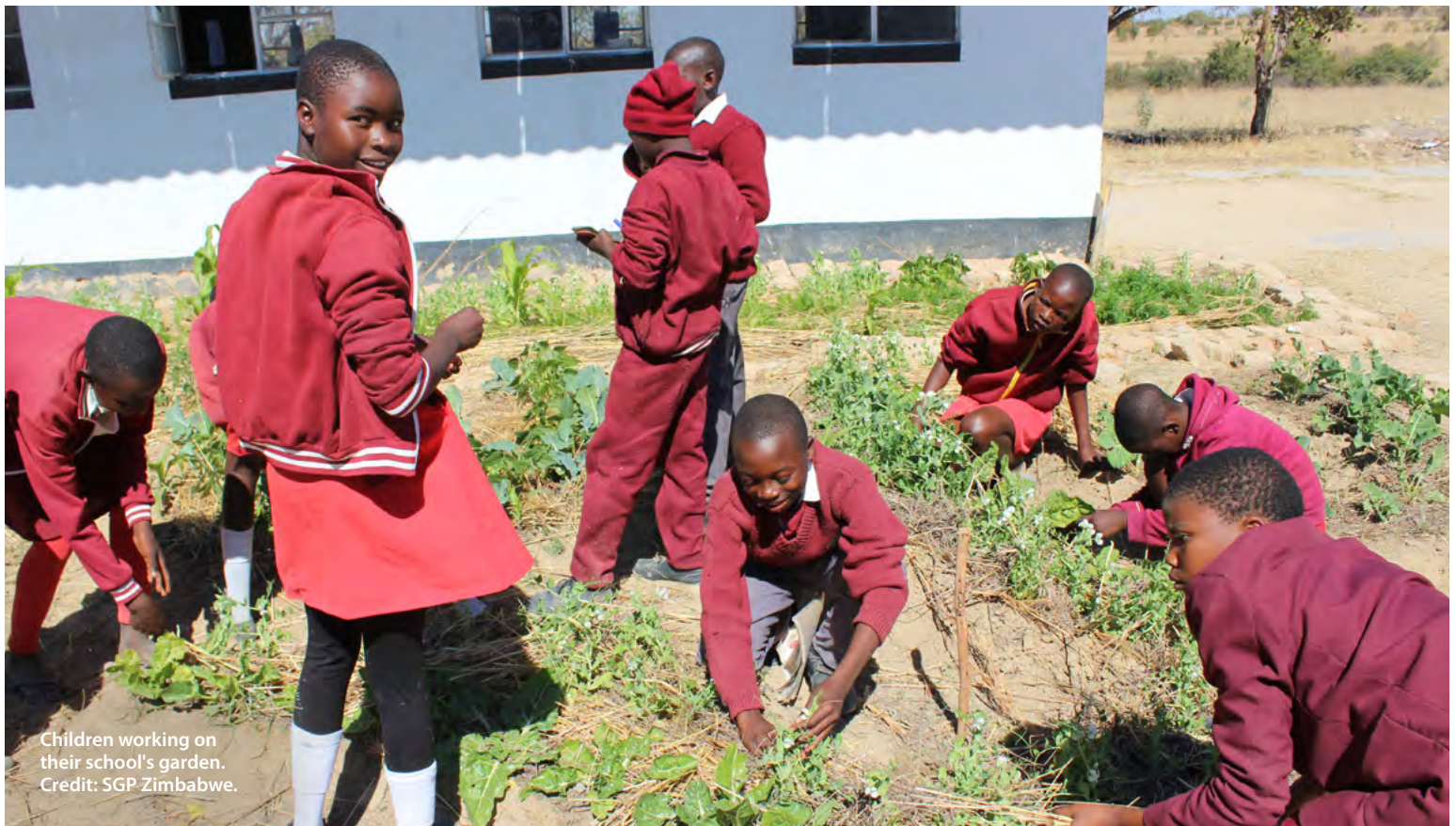
Children working on their school's garden.