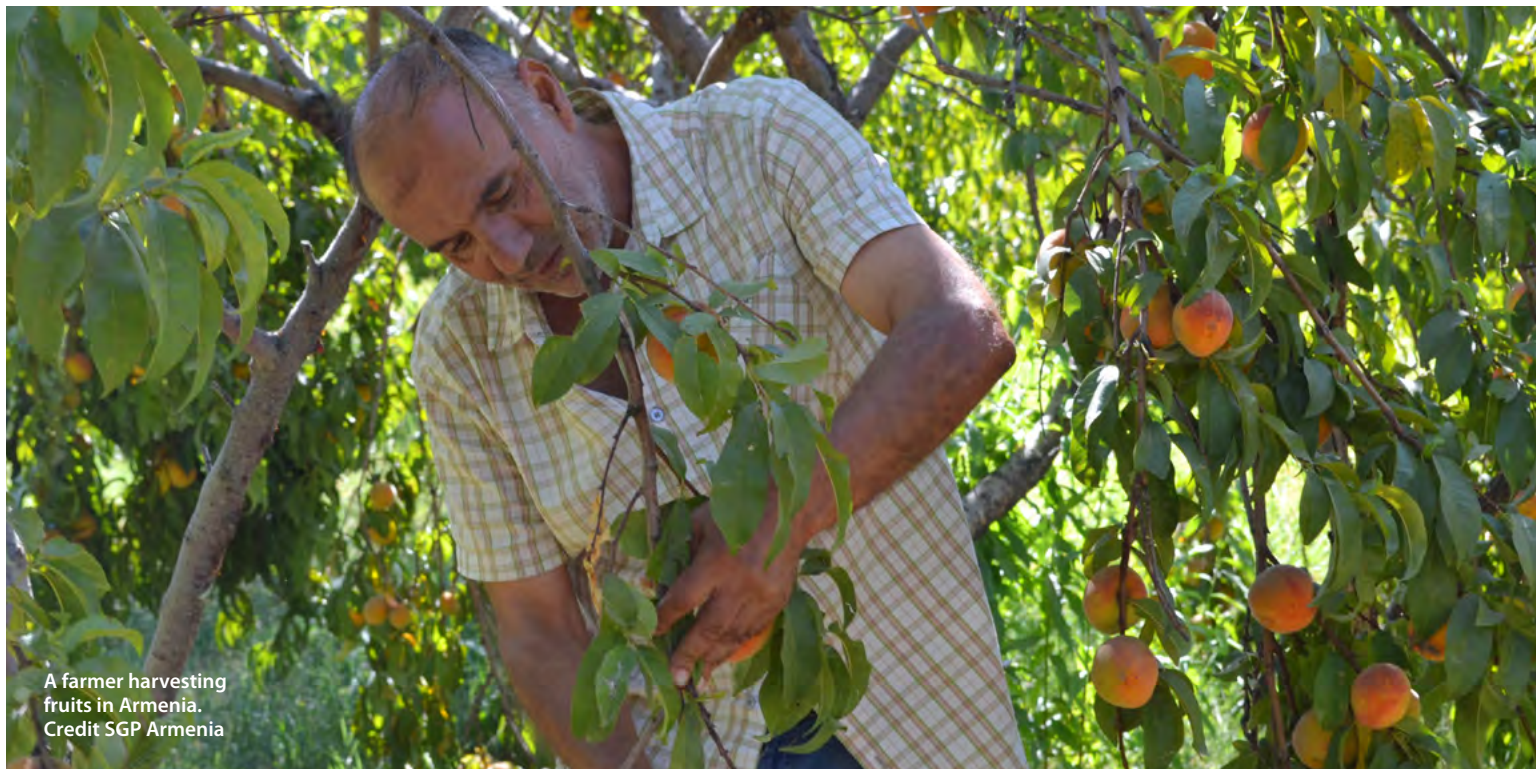
A farmer harvesting fruits in Armenia.

As part of its initiative to support livelihoods and women's empowerment, the project also supported the training of 40 women in making high-quality quilts. With assistance from Japanese Volunteers these quilts are exported to Japan. With this marketing in place, these women earned $400 to $850 annually.