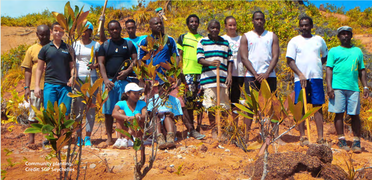
Community planting.