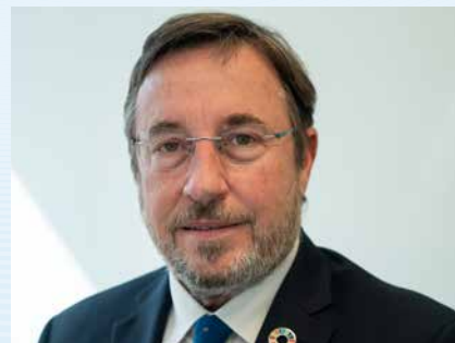
Achim Steiner Administrator, United Nations Development Programme