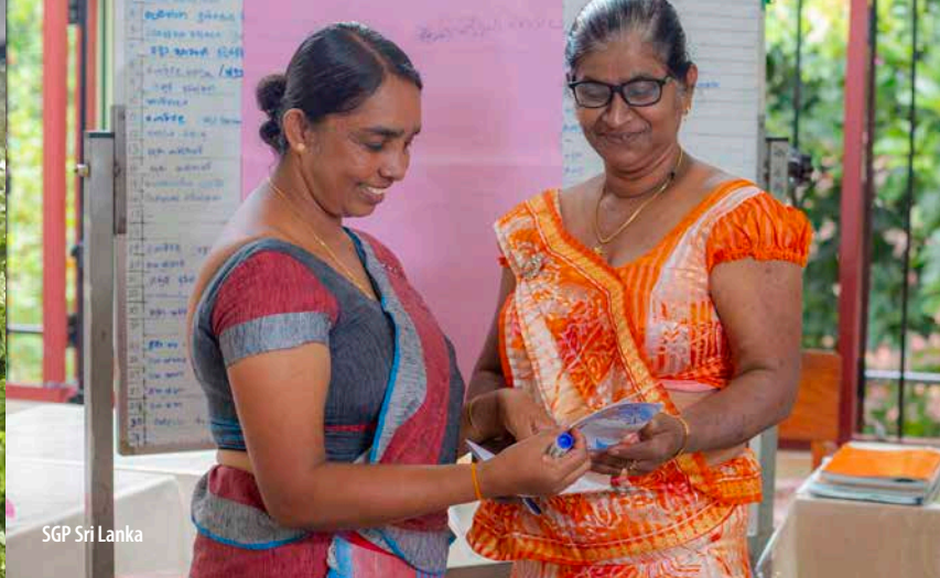
SGP Sri Lanka