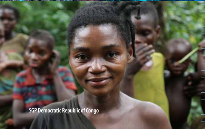
SGP Democratic Republic of Congo

In 2015, the Second Joint Evaluation of SGP reaffirmed that it continued “to support communities with projects that are effective, efficient, and relevant in achieving global environmental benefits while addressing livelihoods and poverty as well as promoting gender equality and empowering women”. The evaluation also noted that replication, upscaling, and mainstreaming were actively occurring through the programme.