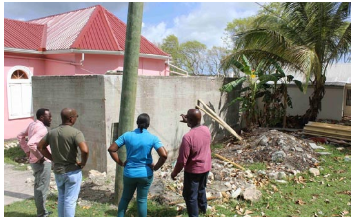
In 2023, projects focused on sustainable agriculture, chemical and waste management, biodiversity conservation and climate change adaptation

For the year of 2023, GEF SGP – Antigua and Barbuda had welcomed 13 new projects and witnessed the successful completion of three others. Currently, 14 projects are under implementation, with an expected few more by the end of the first quar-